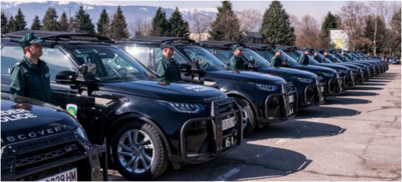
Image description: Bulgarian border patrol vehicles.

Six testimonies described the location of pushbacks as being some sort of “door” in the fence (8.2, 8.3, 8.4, 8.5, 8.6, 8.7). This description matches the image below of small gates in the border fence (see image below). The locations of the border gates differ across the testimonies. This could either mean that there are multiple such gates in the fence or that respondents were not able to identify precisely where they were pushed back. However, consistent reports of similar gates at different spots along the border suggest that there are several such gates.