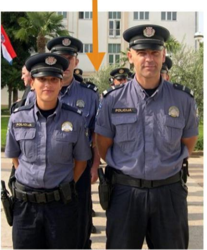
The officer shown in this footage wore a uniform consistent with those worn by Croatia's Temeljna Policija, or regular police

The disparity between these officers - the professional Intervention police and the confused regular police officer - should serve to underscore the spectrum of actors and agents which are involved in push-backs from Croatia. Other reports, for example, regularly describe being apprehended by authorities in the interior wearing uniforms consistent with those worn by Croatia's Specijalna Policija (Special police). Although there may be repeated behavior, techniques, and perpetrators behind these acts, it would be a mistake to characterize these procedures as being perpetrated by the same people, in the same way, each and every time.