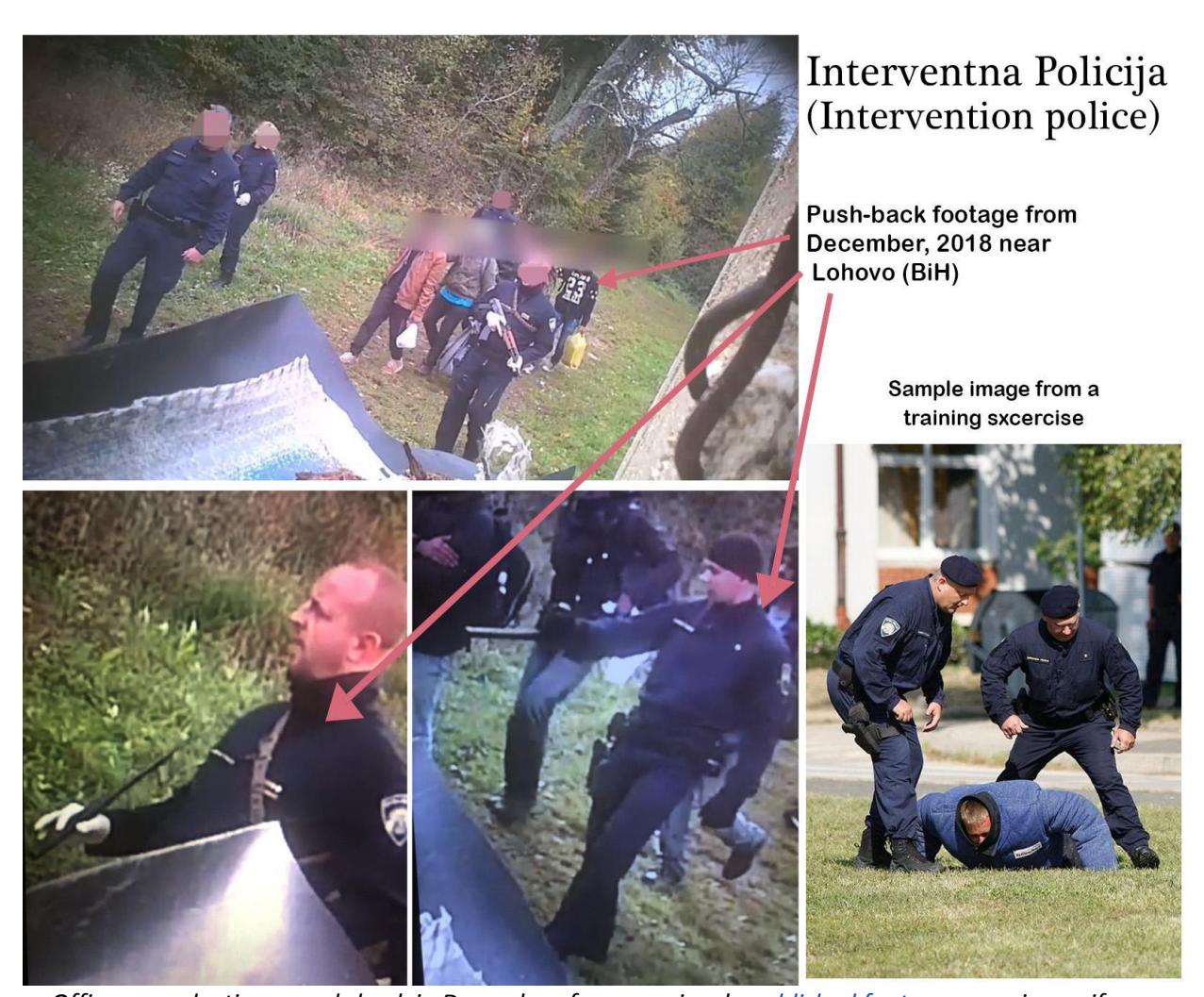
Officers conducting a push-back in December, from previously published footage, wearing uniforms consistent with those worn by Interventna Policija, or Intervention Police

The footage from the last month, however, shows something less structured and less violent. The officer featured prominently in the video is not the tall, muscular, and intimidating male officer archetype described in many other push-back reports. Rather, the officer depicted in this video is an older and grey-haired man with a wiry frame. He does not carry himself with confidence, but almost seems unsure about what actions are expected in this situation. The officer is shown radioing to an unknown recipient, saying "They saw the sign on the board and started getting wild". A short while later he radios again, telling the individual on the other end: "It seems they realize they are again at zero point".