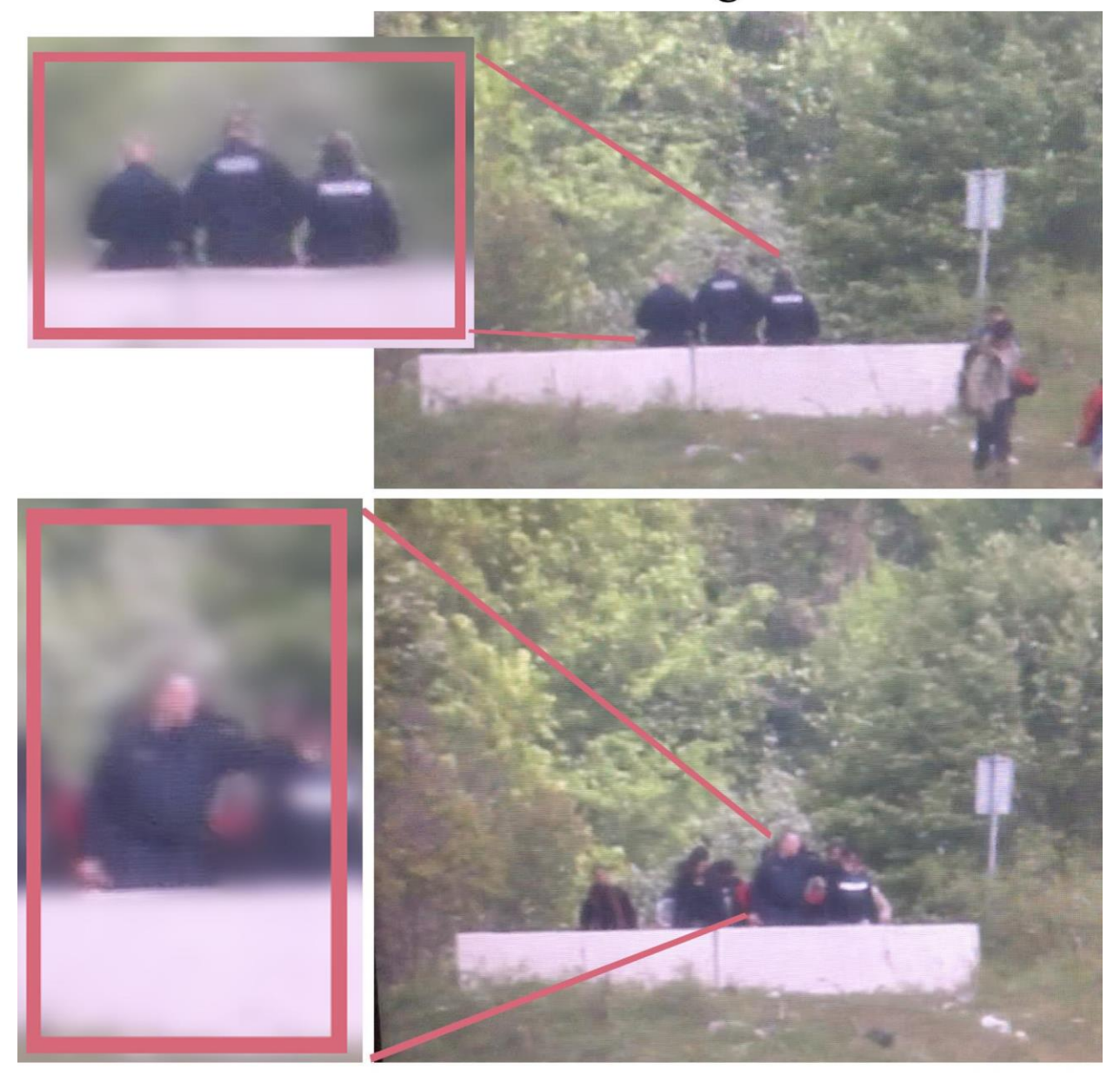
The uniforms worn by the officers shown in this video appear to match those worn by Interventna Policija officers

The regional response to this footage was strong. For its own part, the Croatian Ministry of the Interior issued a <u>press release</u> in response to the video, denying all accusations that the footage depicted an illegal collective expulsion, instead framing the footage as depicting the practice of "discouraging" people-in-transit from entering the country irregularly: