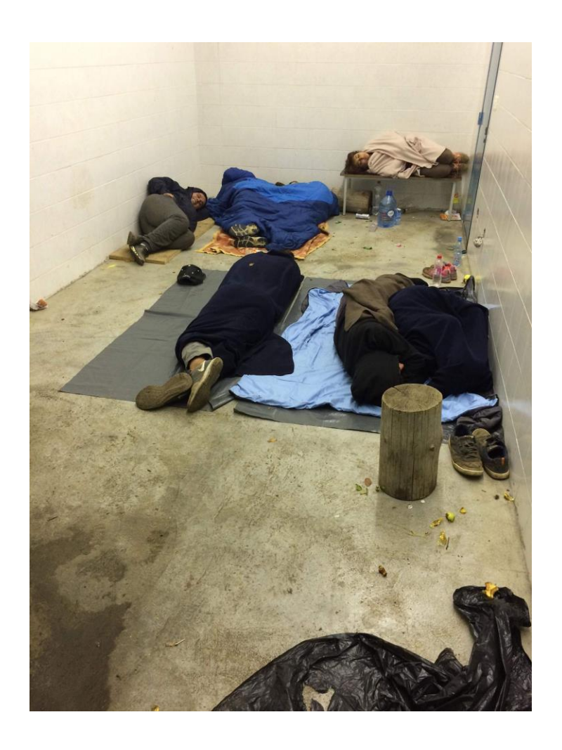
Detention cell in Slunj (HR)

The image shows a harshly lit, windowless room with neither floor isolation nor seating accommodation but detainees sleeping on blankets on concrete floor.