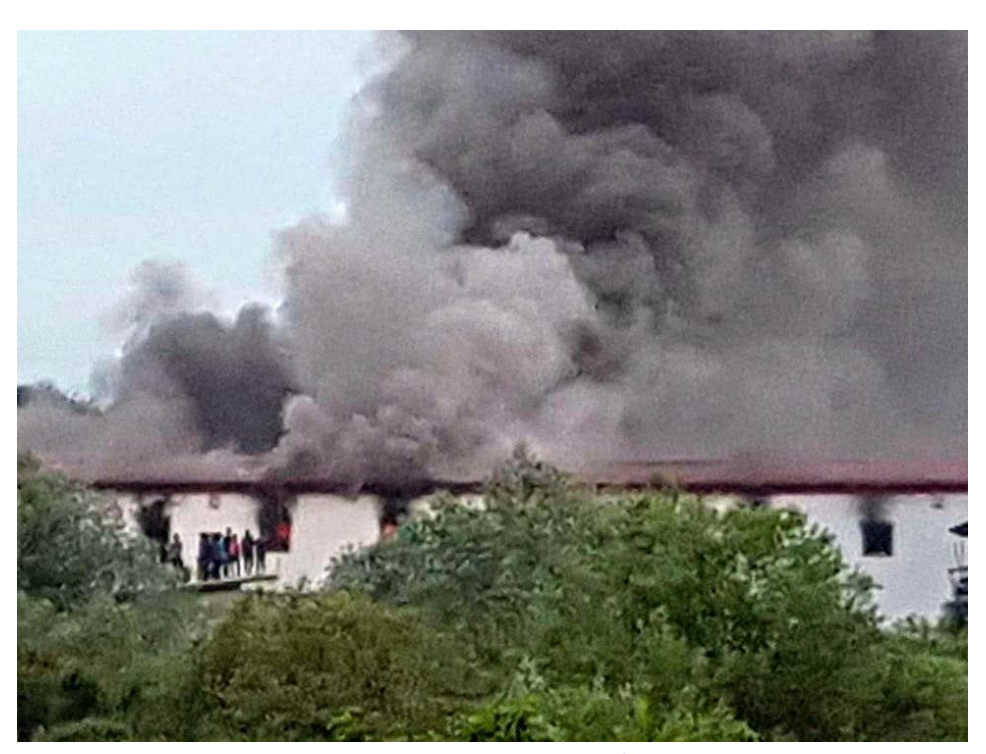
Miral camp burning on 1 June

On the morning of June 1st, a fire broke out on the second floor of the IOM-run Miral Camp outside of Velika Kladuša. Nearly four hours after the fire started, the local fire department had the blaze under control. In total, at least 32 people were injured in the fire, several of which suffered severe burns. 22 people were taken to the Cantonal Hospital in Bihać for treatment while 10 were taken to the local hospital in Velika Kladuša. Moreover, many camp residents reported losing clothes, sleeping bags, and personal belongings in the flames. Reports indicate that the fire may have been started by a faulty electrical outlet.