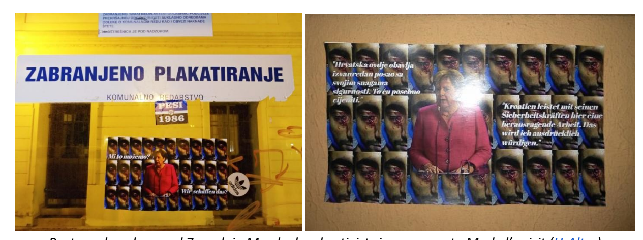
Posters placed around Zagreb in May by local activists in response to Merkel's visit

What Merkel described as "progress" in 2018, was in fact the entrenchment of extrajudicial violence and the circumvention of international asylum law on a systematic scale. It should be noted, however, that since reporting on these "push-back" tactics has broken into the mainstream media, EU leaders have had to become more subtle in their advocacy of such frontier policies. Merkel has, for example, attempted to <u>distance herself</u> from the excesses of the Viktor Orban's securitization efforts in Hungary.