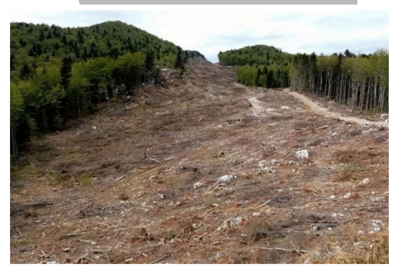
LOGGING CARRIED OUT ON THE HR/BIH BORDER

Fences and man made obstacles are a common fixture of the EU external border, used to interrupt safe passage and injure people as they circumvent ever harder borders. Less common is the logging of entire sections of pinewood forest for the purpose of detecting "irregular" crossings. However, this has been the recent approach taken by the Croatian state who commissioned forestry workers to clear trees from an eight kilometre stretch of border with BiH.