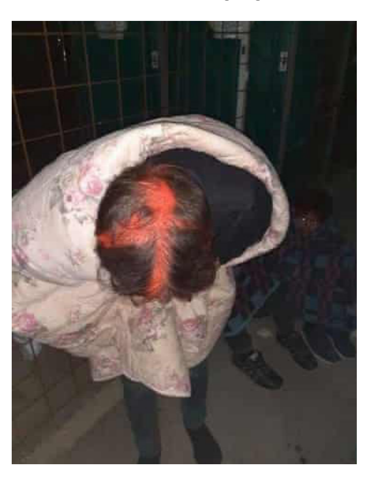
CROSS SPRAYED ON THE HEADS OF PUSHED BACK TRANSIT GROUP

A number of the cases recorded by BVMN show references to drunken officers during illegal cross-border