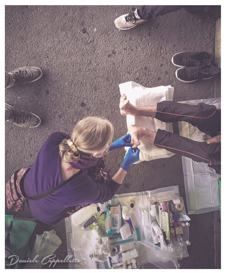
MEDICAL VOLUNTEERS TREAT NEW ARRIVALS FROM THE BALKAN ROUTE

The removals are being justified with an old agreement made in 1996 that allows Italian police to readmit in Slovenia those who were found next to the border (previously it was 5 km, now within 10 km) within 24 hours from their arrival. One of the grounds used to remove people from Italy is their right to apply for asylum in Slovenia where they transited. This illusion, which BVMN, through its partner organization InfoKolpa, have evidenced to be consistently false, was also supported by a recent court finding in Genoa where an Italian judge stayed a removal order under the Dublin Agreement. The court found "the conditions of receiving refugees in Slovenia and systemic shortcomings in the asylum procedure" strong enough grounds to halt the removal, raising questions as to how authorities in the border area can now effect such readmissions with impunity. The Italian Consortium of Solidarity (ICS) and Caritas Trieste challenged this abuse of the bilateral agreement with Slovenia, arguing that "readmissions or other forms of rejection at the border of those that intend to claim asylum are illegal".