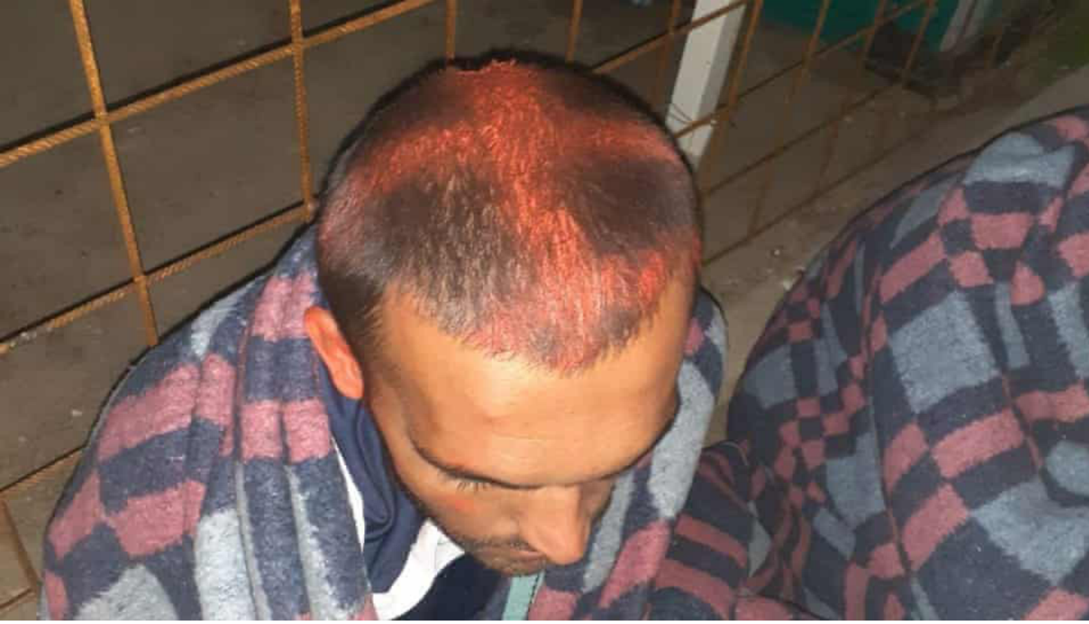
CROSS SPRAYED ON THE HEADS OF PUSHED BACK TRANSIT GROUP

violent pushbacks and torture by the Croatian police" occuring at the border. Furthermore, a <u>feature report</u> by BVMN on pushbacks from Croatia during 2019 found that across 12 months of data, over 80% or recorded cases amounted to "torture or cruel, inhumane and degrading treatment". Thus the latest development of paint tagging is yet another in a long line of torturous practices, some of which include: