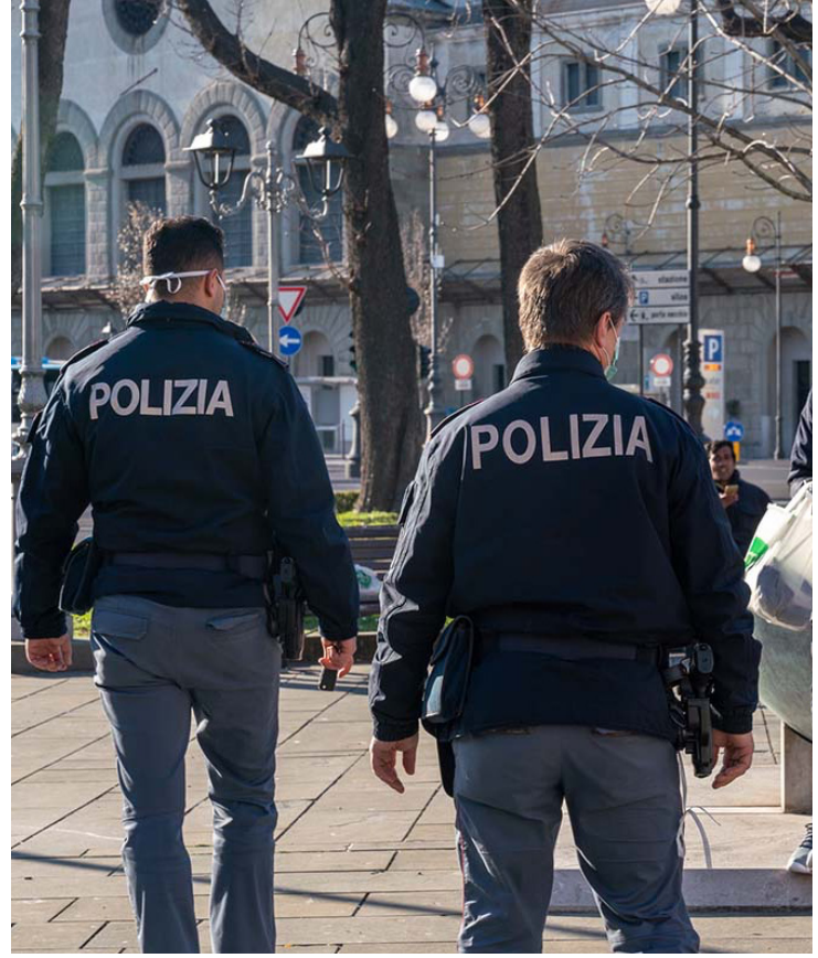
ITALIAN POLICE PATROLLING CENTRAL TRIESTE