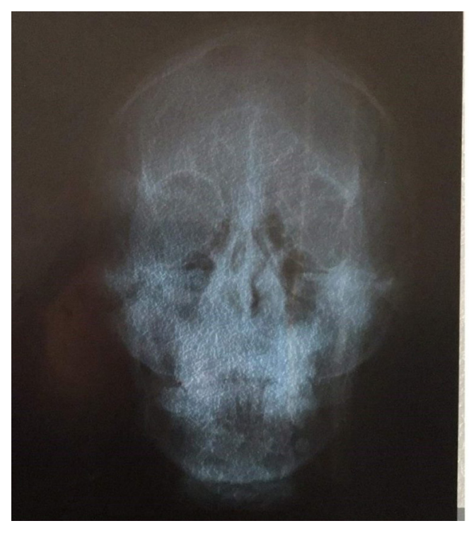
SKULL INJURY FROM ROMANIAN PUSHBACK