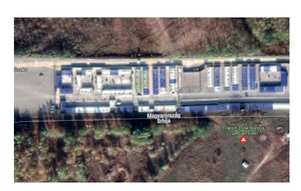
Rozke Transit Zone where people were recently released from unlawful detention

The last two months have thrown the Hungarian asylum system into turmoil. As laid out in previous reports, the European Court of Justice (ECJ) has ruled that Hungary's practice to reject almost all asylum applicants based on inadmissibility, if the applicant has transited through a "safe" country, is incompatible with European law. In a second case, the ECJ decided that the transit centers at the Hungarian border, the only entry point to the Hungarian asylum system, constitute unlawful detention. In effect, this means that the ECJ has overturned some of the most important elements of Hungary's inhumane asylum system.