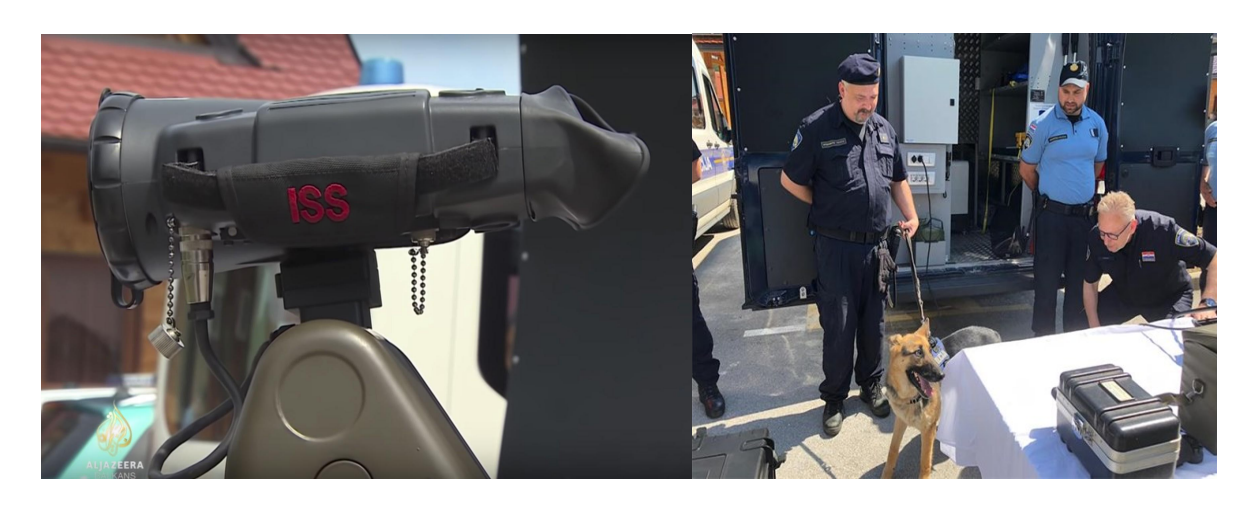
Left image - iSS Thermal Camera, T-iV <sup>2</sup>; Right image - A K9 unit; The MUP recently put into service <u>23 new vehicles</u> for the transport of k9 units to be used in border management