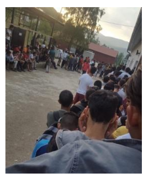
Left image - Victim of excessive force in Usivak; Right image - Waiting for food at Usivak camp (shown above) can take up to 2 hours and on most days not all are fed even after waiting in the line for 2 hours. The security guards often push people and shout at them to go to the back of the line.

More residents inside the Ušivak camp report on the excessive use of force displayed by security guards while the residents line up for food. In interviews with ten camp residents, all explain the same situation. The line for food is long and invariably there are people who push and cut in the line, as a response the security guards use their force to start pushing and shouting at the refugees to go to the back of the line. After the refugees receive their food, which can take up to two hours of waiting in line, there are reports the security guards will interrupt their eating and check the refugees' IOM ID cards to make sure they have the proper documents that allow them to eat in the camp. If they do not have proper documentation the security guards take their food and the refugees are thrown out of the cafeteria.