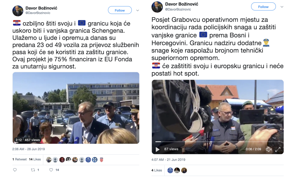
Left Image - "Croatia seriously protects its EU border which will soon become the outer Schengen border. We are investing in personnel and equipment, today we put in to service 23 out of 49 vehicles for transport of service dogs [K9 unit] which will be used for protection of the border. 75% of finances for this project comes from EU Internal Security Fund." Right Image - "A visit to Gabrovac an operative place for coordination of the work of police forces and protection of exterior border towards BIH. The border is controlled by extra police forces who have at their disposition superior technical equipment...Croatia will protect its exterior border and will not become a hotspot."

During the event, Božinović answered a <u>question</u> as to the allegations of Croatian police officers denying individuals the right to seek asylum. His [translated] answer follows in full: