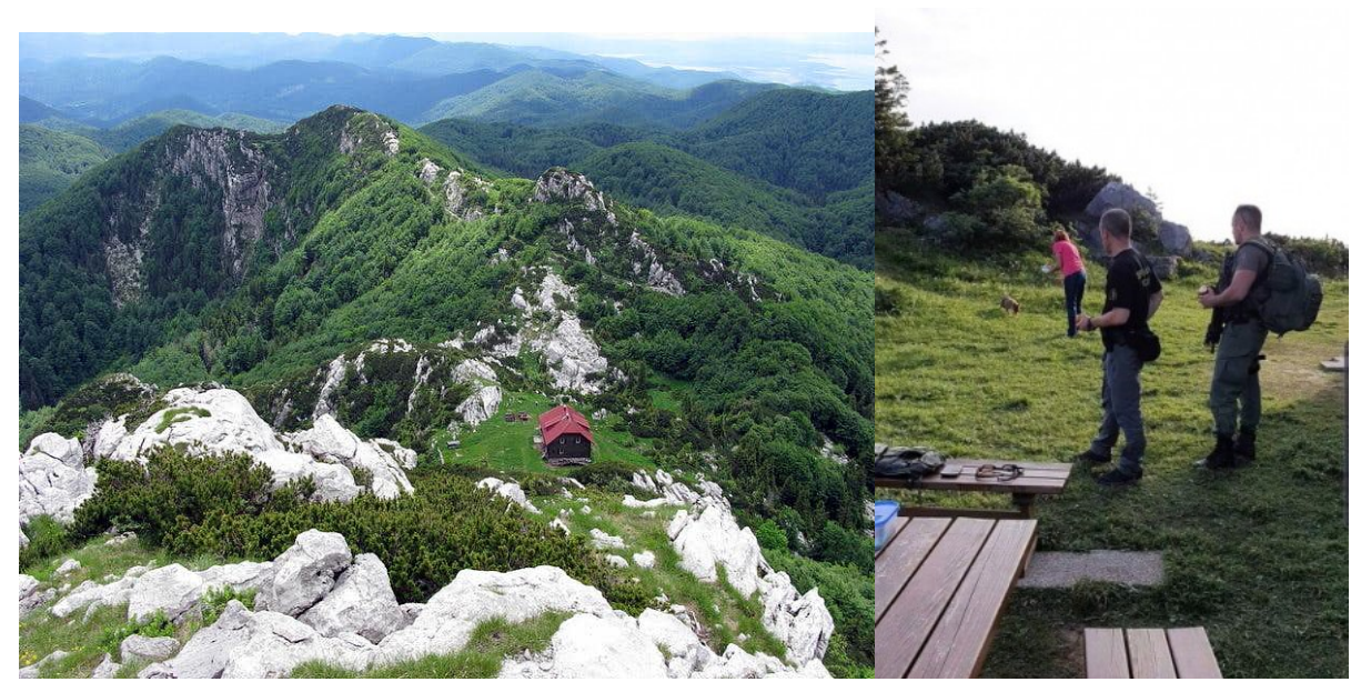
Left image - The hut on Risnjak where the incident took place ; Right image - Picture of the Specijalna Policija present during the event, taken by the hiker

In mid-June, an <u>open letter</u> written by a hiker who witnessed an operation by Specijalna Policija against a transit group was published in Croatian media. The incident took place in the mountains of Risnjak, in the forested region in between Rijeka and Karlovac. The text provides a unique, first hand account of Croatian police using the mountain range as a base for "hunting" groups attempting to transit through Croatia. Furthermore, the letter offers a valuable insight into the methodology of Specijalna Policija patrolling this region, corroborating the many testimonies of such violence gathered in BiH.