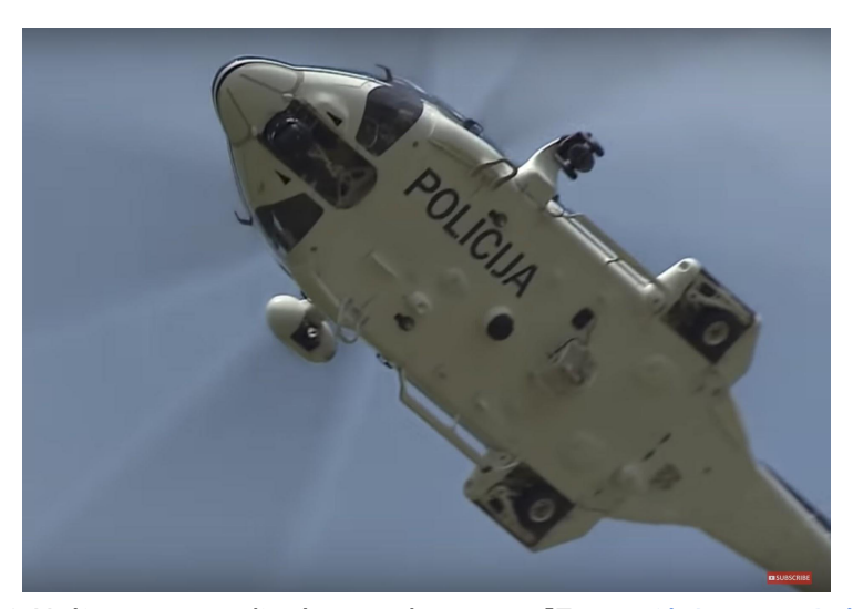
AW139 Helicopter on display at the event

Arriving on the Italian test registration I-EASM, the helicopter will become 9A-HRP in due course. It is serial 31715 from the Finmeccanica<sup>5</sup> production line in Italy. The Croatian Police also operates three JetRangers, one AB212 and a pair of EC135P2"