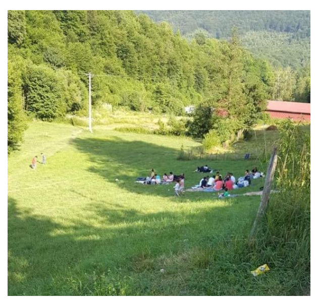
A family of 19 individuals forced to sleep rough outside of Ušivak

Ušivak camp, located 20 km outside of Sarajevo, the camp is currently filled to over twice the official capacity of 400, with 900 people currently living within the premises. While some are allowed in despite the overcrowding, many are left to sleep outside the camp for days, lacking the necessary papers from the SFA. Over the weekend of June 28-30, a family of nineteen individuals, including nine children, were left sleeping in the grass without shelter, blankets or food.