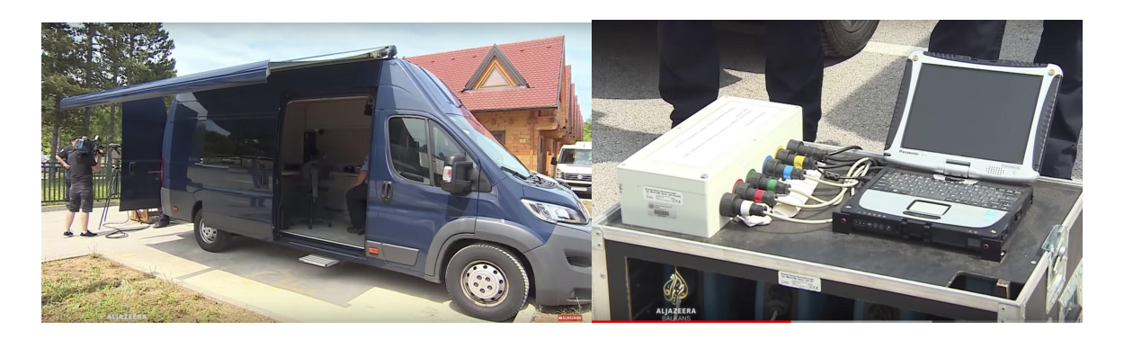
Left image - A "mobile stations" on display during the event. These are vans equipped with surveillance equipment largely manufactured by FLIR, a multi-national company specializing in surveillance and security systems based on infrared technology; Right image - "There is also a special vehicle for identification and a device that recognizes heartbeat that is also in the van. Everything is financed by the EU. "

An AW139 helicopter was also on display at the event. The Croatian MUP ordered a new AW139 in February, 2019 to be "operated mainly in border control operations, including maritime tasks", bringing the total number of these helicopters owned by the MUP to three. This complemented the two other AW139's that the MUP had obtained in 2016 - the first in January of that year and the second in July. These two helicopters were also obtained for a "primary role as border protection".