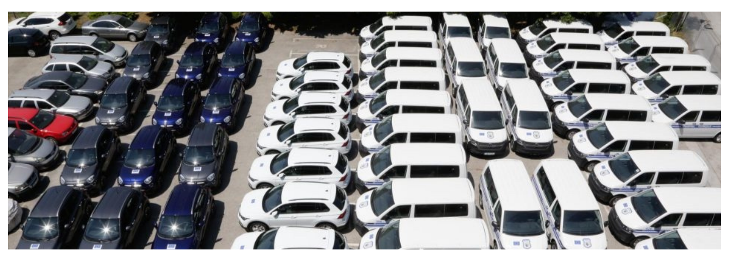
Vans donated by the EU to the Bosnian authorities