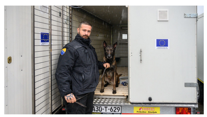
Bosnian police officer with a guard dog

Without the existence of a comprehensive and independent oversight mechanism, these donations further prioritize the criminalization over the assistance to people-on-the-move, and are likely to further enable human rights abuses by police officers.