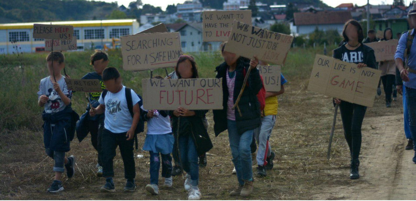
Protest for the freedom of movement organised by POMs