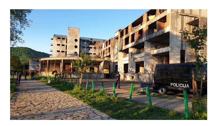
Police officers during the eviction of Dom Penzionera

When the POM returned to town, most of them neither had food nor a sleeping place for the night. As a result, all of the individuals that were evicted and brought to the camp that day ended up on the street of Bihac.