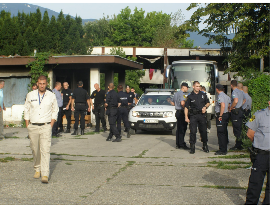
Police officers and SFA during the eviction in Krajna Metal in Bihać

The other main abandoned building used as a place of shelter in Bihac, Kranja Metal, was also evicted on the 13th of July, 2021. Previously an old the building sheltered factory, approximately 253 people and was evicted by the SFA in cooperation with IOM and the Bosnian Authorities and forcibly transported to the Lipa camp. Like the "Dom Penizionera" eviction, the removals took place early in the morning and accounts of police violence were reported. The move fits into an ongoing pattern of evictions and dispersals to Lipa which impacts people across urban and rural squats in the Bihac area, and across wider Una- Sana Canton (USC).