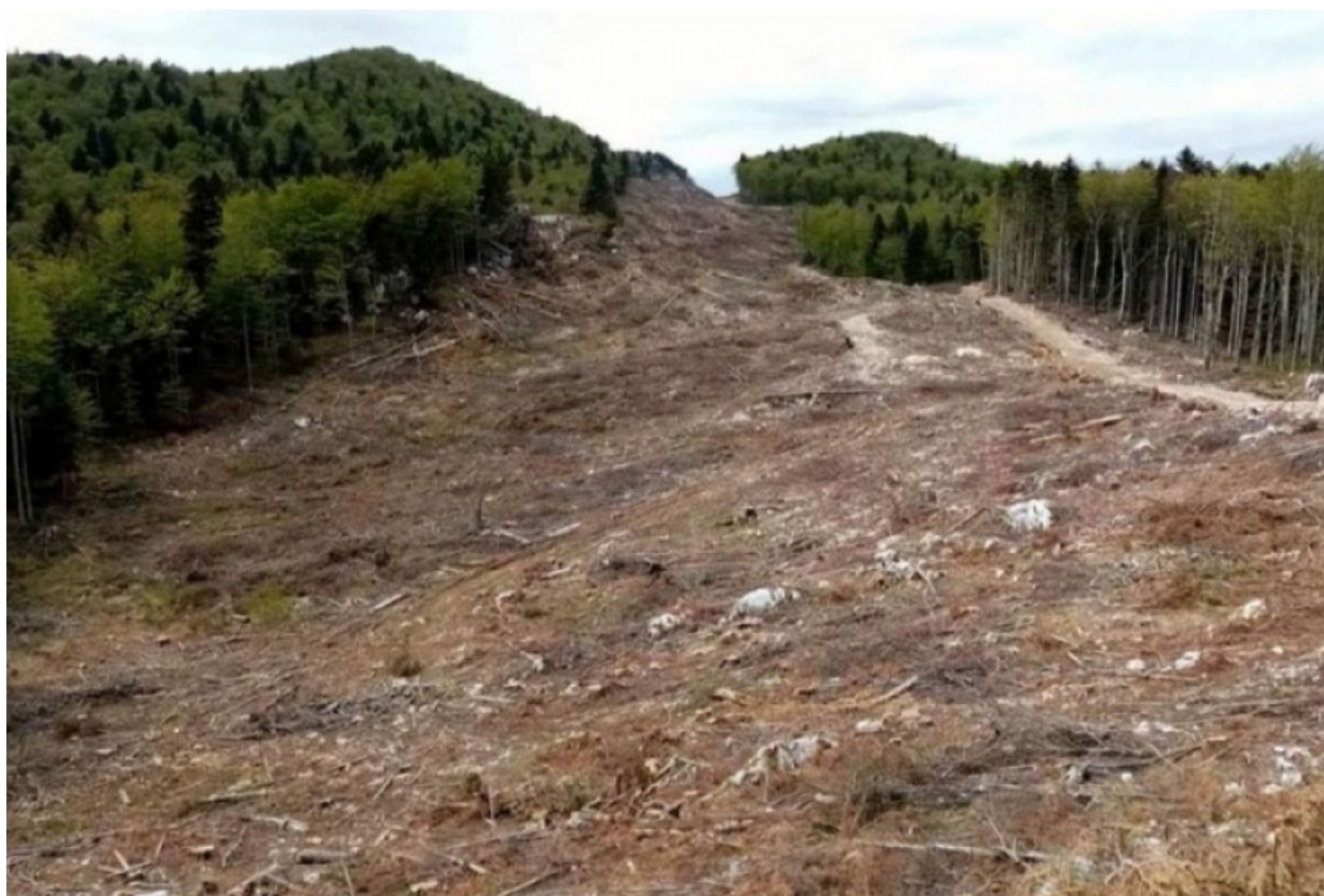
LOGGING CARRIED OUT ON THE HR/BIH BORDER

Fences and man made obstacles are a common fixture of the EU external border, used to interrupt safe passage and injure people as they circumvent ever harder borders. Less common is the logging of entire sections of pinewood forest for the purpose of detecting “irregular” crossings. However, this has been the recent approach taken by the Croatian state who commissioned forestry workers to clear trees from an eight kilometre stretch of border with BiH.