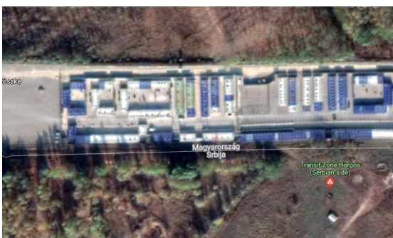
Rozke Transit Zone where people were recently released from unlawful detention

The last two months have thrown the Hungarian asylum system into turmoil. As laid out in previous reports , the European Court of Justice (ECJ) has ruled that Hungary’s practice to reject almost all asylum applicants based on inadmissibility, if the applicant has transited through a “safe” country, is incompatible with European law. In a second case, the ECJ decided that the transit centers at the Hungarian border, the only entry point to the Hungarian asylum system, constitute unlawful detention. In effect, this means that the ECJ has overturned some of the most important elements of Hungary’s inhumane asylum system.