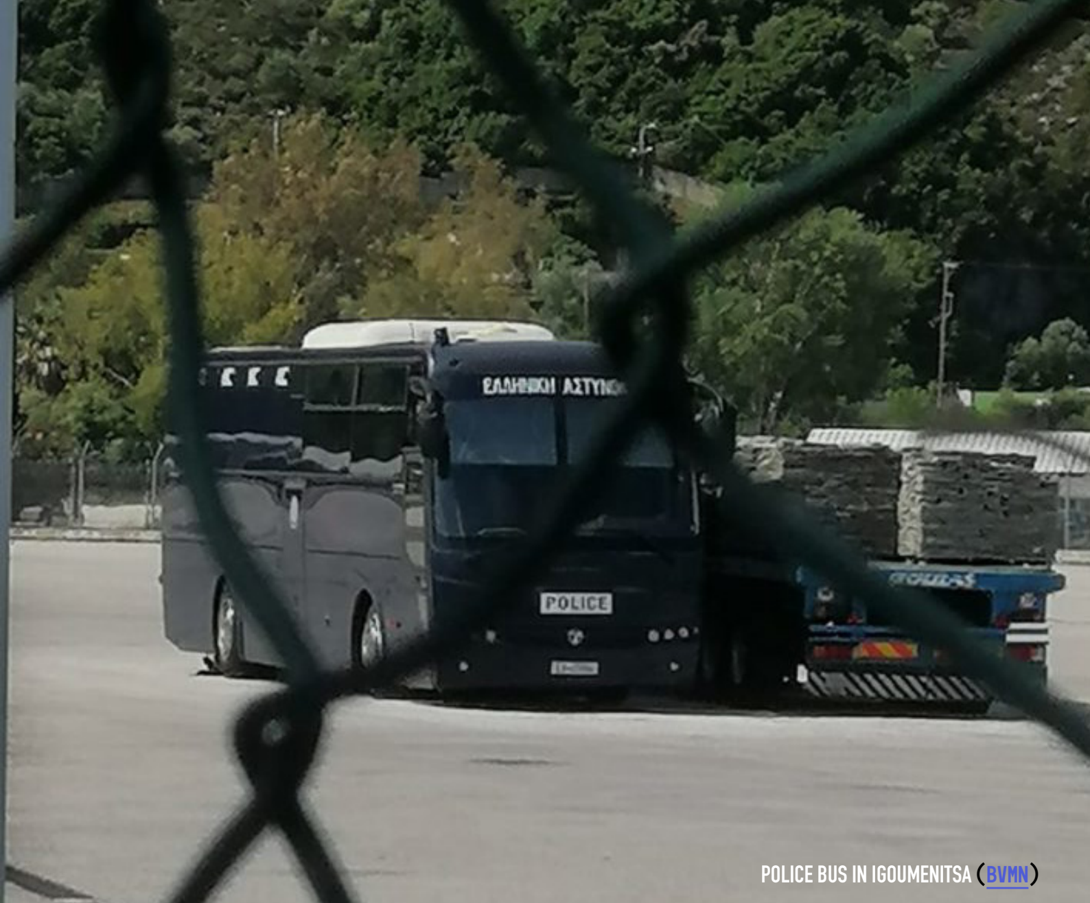
POLICE BUS IN IGOUMENITSA ( BVMN )