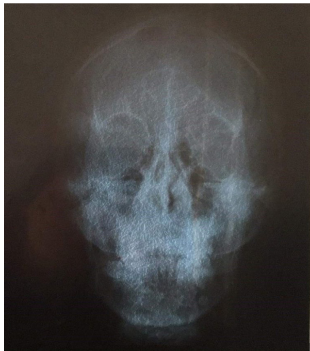
SKULL INJURY FROM ROMANIAN PUSHBACK