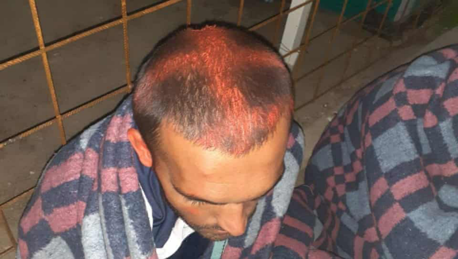
CROSS SPRAYED ON THE HEADS OF PUSHED BACK TRANSIT GROUP

violent pushbacks and torture by the Croatian police” occurring at the border. Furthermore, a feature report by BVMN on pushbacks from Croatia during 2019 found that across 12 months of data, over 80% or recorded cases amounted to “torture or cruel, inhumane and degrading treatment”. Thus the latest development of paint tagging is yet another in a long line of torturous practices, some of which include: