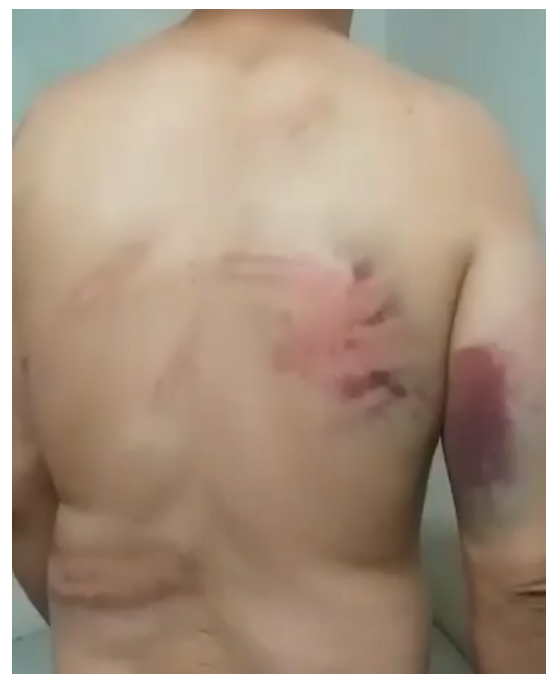
BRUISES FROM BEATINGS DURING PUSHBACK ( BVMN ).

Not long after it became clear pushbacks of large groups were also happening in Igoumenitsa as well, on the Western coast of the mainland. The first testimony (see 6.9 ) reports that 17 persons were taken from the “ jun-gle ”, an informal settlement near the port, and driven for around 10 hours in a locked police bus “with separate cells which you cannot run away from... you cannot see outside”. The second (see 6.12 ), concerning a group of 15 persons, reports the same transportation, and both reports detail the use of excessive violence by officers. The respondent in the latter testimony had been documented by the Greek Asylum Office and UNHCR, and was awaiting an appointment to receive his International Protection Application Card; the pushbacks of documented individuals is also a concerning new development.