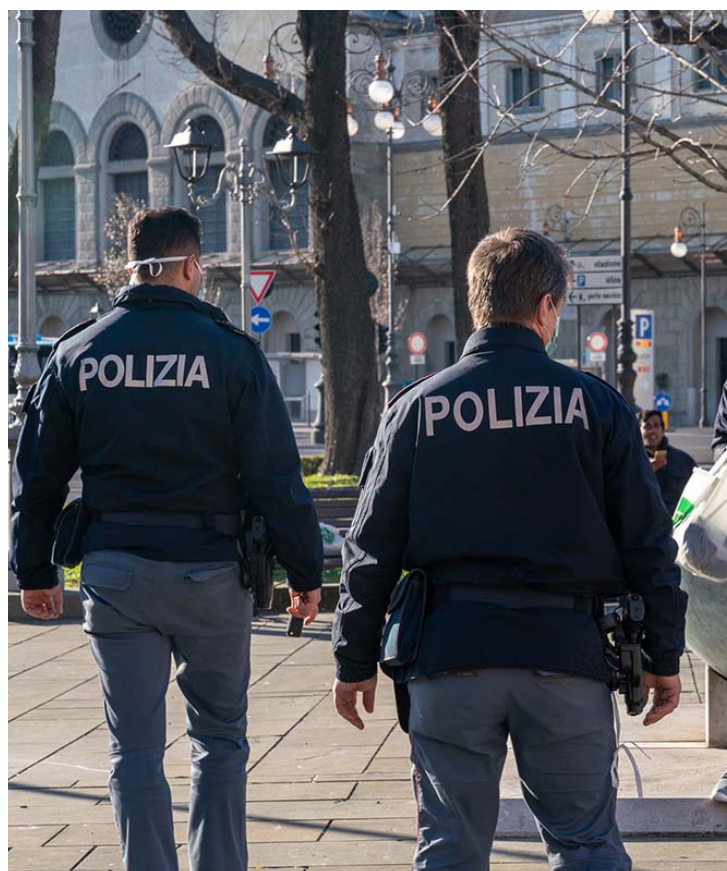
ITALIAN POLICE PATROLLING CENTRAL TRIESTE