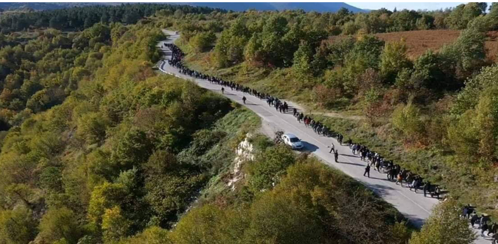
FORCED DISPERSIONS IN BIH. CONDITIONS WHICH BREACH ARTICLE 3, ECHR

The landmark findings from the Spanish enclave of Melilla produced in February of this year have certainly come under scrutiny again with these new court proceedings. Unfortunately the court in Strasbourg was previously found to back EU members states in their application of illegal collective expulsions. With Croatia now being examined for its abuses, those that have been monitoring the escalation of pushbacks to Bosnia-Herzegovina since 2018 are hopeful that a favourable judgment will be passed, so that violent and illegal practices against people-on-the-move can finally be called out for the crimes that they are.