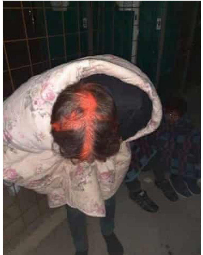
CROSS SPRAYED ON THE HEADS OF PUSHED BACK TRANSIT GROUP

A number of the cases recorded by BVMN show references to drunken officers during illegal cross-border