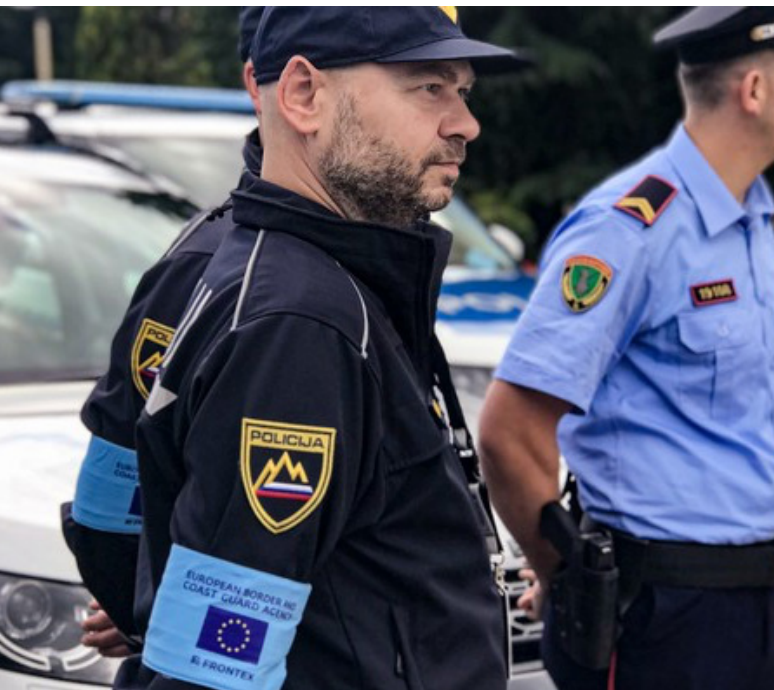
FRONTEx OFFICERS FROM SLOVENIA WEARING THE AGENCIES BLUE ARMBAND

Certainly Albania shares a responsibility for the fair treatment of transit communities, underlined by a recent article by Balkan Insight citing overcrowded reception facilities, with violent gangs, insufficient food, and dire conditions. However, the development of a Frontex operation which is carrying out systematically illegal practice positions the EU, and its migration strategy, as the primary actor in redrawing the access to safe passage through this border. In what might be considered an inherently neo-colonial fashion, Frontex is playing an instrumental role in embedding patterns