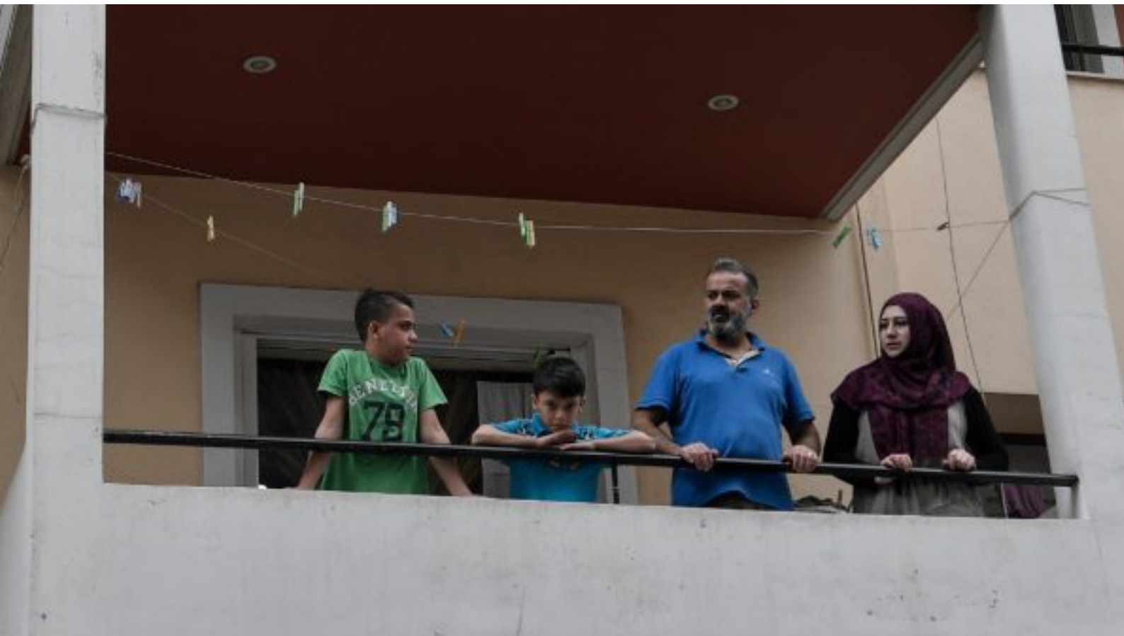
A FAMILY FROM IDLIB, SYRIA. ONE OF THE MANY SUBJECT TO THE NEW EVICTIONS

The Mitsotakis government has reduced the tenure of housing from six down to one month for those who receive their protection status. The latest closures and evictions are in line with this move to remove basic accommodation services in Greece, and make it harder for people to stay in the country. The enforced homelessness also has a direct link to the risk of being pushed back to Turkey. BVMN recorded almost 600 people being illegally removed to Turkey from Greece in April and May. Notably, the vast majority were seized by police from the street, squatted sites or informal settlements close to the official camps. It is concerning that an additional 11,000 people are now also at risk of this fate.