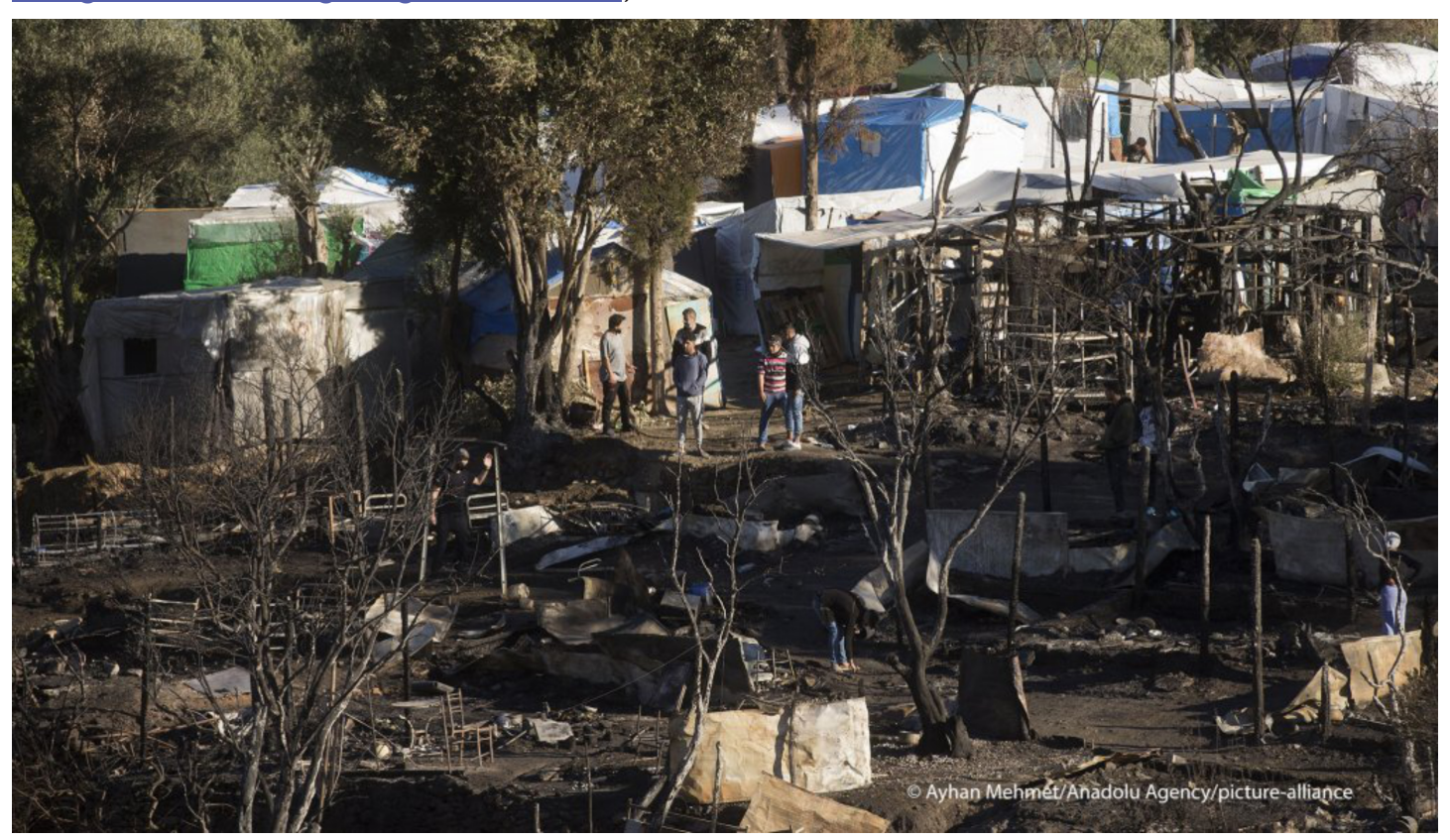
Burnt tents caused by a fire in November

Additionally to these dire conditions, a powerful earthquake reaching 7.0 on the Richter Scale hit Samos on the 30th of October. International Rescue Committee (IRC) published a report this month to decry the mental toll that the 'hotspot approach' has had on arrivals to Samos – demonstrating that the "dangerous, overcrowded and inhumane living conditions" of the Greek camps have resulted in "consistent accounts of severe mental health conditions".