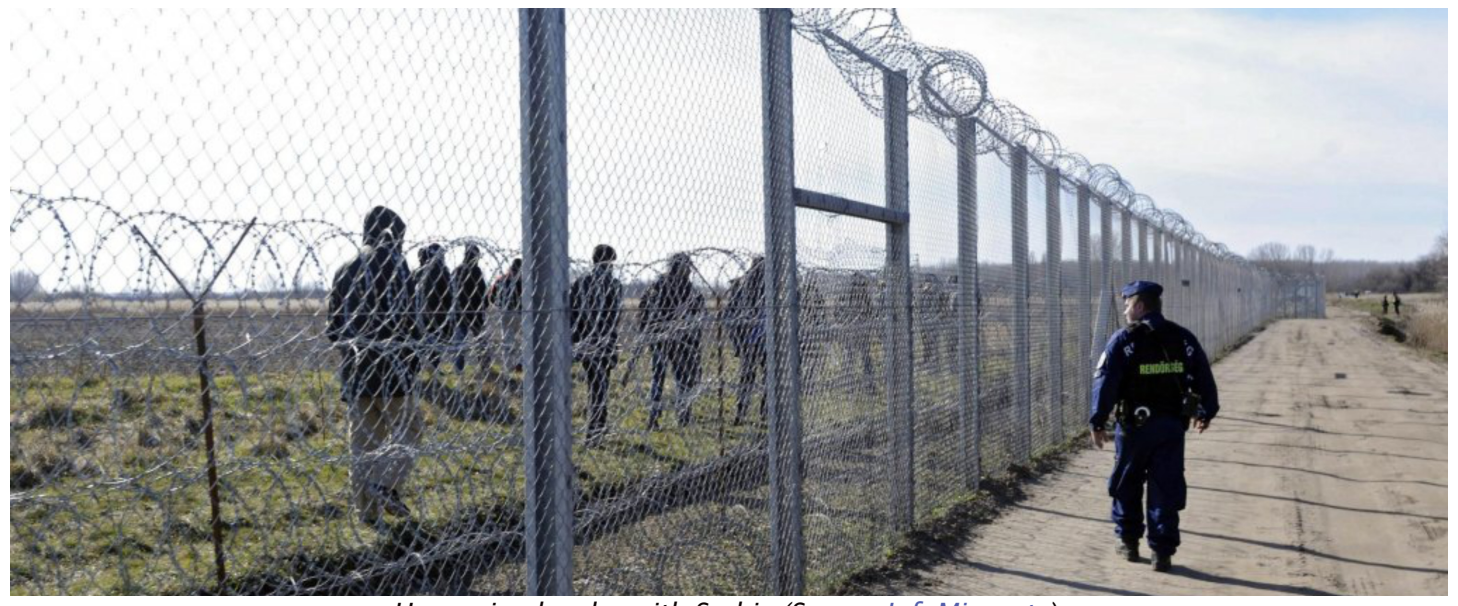
Hungarian border with Serbia