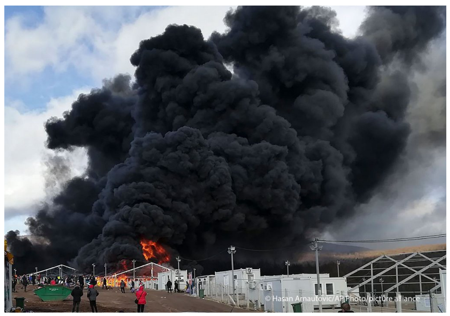
Fires rip through the structures in Lipa

On the afternoon of 22nd December, some citizens of Bihać gathered in front of Bira, and blocked several IOM vans carrying 46 people-on-the-move who were to be accommodated there. Shortly afterwards, a fire brigade vehicle also arrived in front of the former factory and was parked across one entrance in order to block further access. The following morning an extraordinary meeting was held in USC, with local authorities contesting the decision of the central government of Sarajevo ordering the relocation of people from Lipa to Bira. In reaction, IOM began withdrawing their