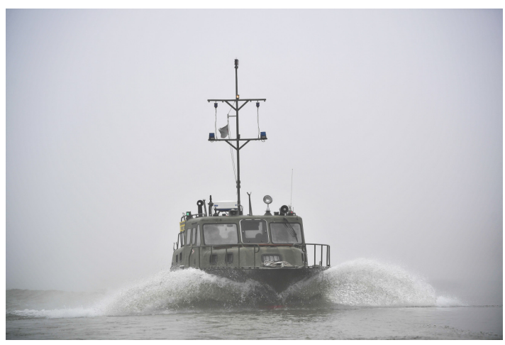
Hungarian police on the Tisa River the-move that teams on the ground are reaching, numbers of these incidents are hard to estimate, and there is only partial data on these injuries, disappearances and deaths

These processes of fortification of the border, force people-on-the-move to take more dangerous and clandestine routes with regular reports about people drowning in the River Tisa or severely injuring themselves when trying to cross the border fence. From the relatively small amount of people-on-