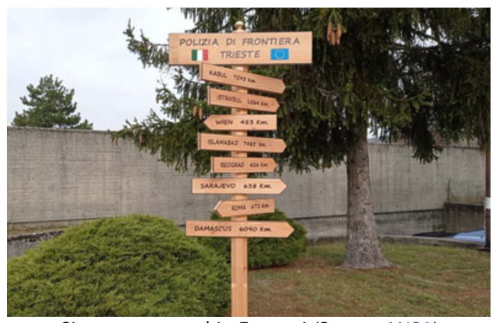
Signpost erected in Fernetti

For those who do avoid the ever present risk of being pushed back to Bosnia-Herzegovina or Serbia, the struggle persists with a massive deficit in winterised accommodation. As noted in the November Report, there are still no operating dormitories in Trieste that can be contacted from the street. Instead, people regularly sleep rough, and report being