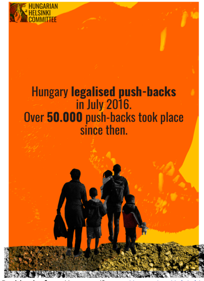
Pushbacks from Hungary

Other parts of the recent ruling are more promising. The ruling slammed Hungary's pushback practices. Reaffirming the illegality of pushbacks (which have been de facto legalized in Hungary since 2016) is important — especially, in light of this year's European