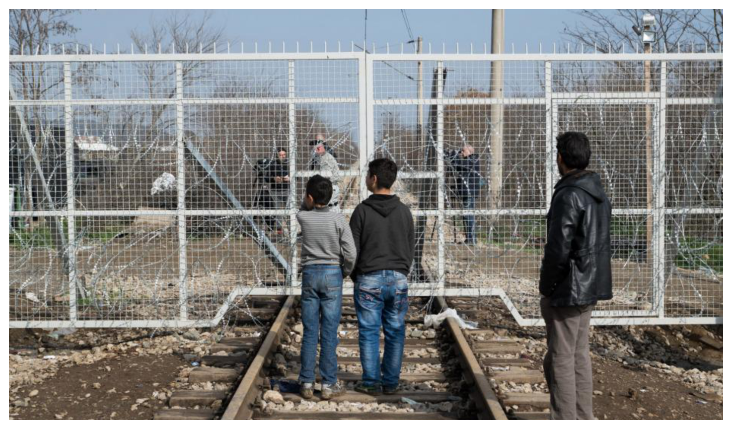
Gate between N. Macedonia and Greece

A <u>BVMN report</u> from September 2020, recounts how the officers opened the door of the vehicle that had brought them to the border, pepper sprayed the respondent in the face and pushed him back through the gate to Greece. Another <u>report</u> from August 2020, describes how officers struck the group-members several times with their batons, before using the same gated location to eject the group. Upon return to Greece some people remain in the border area, highlighted by a <u>InfoMigrants report</u> in July describing the revolving transit population around Idomeni. Many however make the journey south to Thessaloniki, following the railway line either on foot or by boarding trains. This cycle in transit and pushbacks has become a permanent fixture of the Greek-North Macedonian border, symbolised by the gate through which groups are forced from on territory to another.