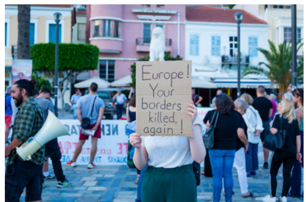
Pictures of protest that took place in Vathy, Samos following the Pylos shipwreck.