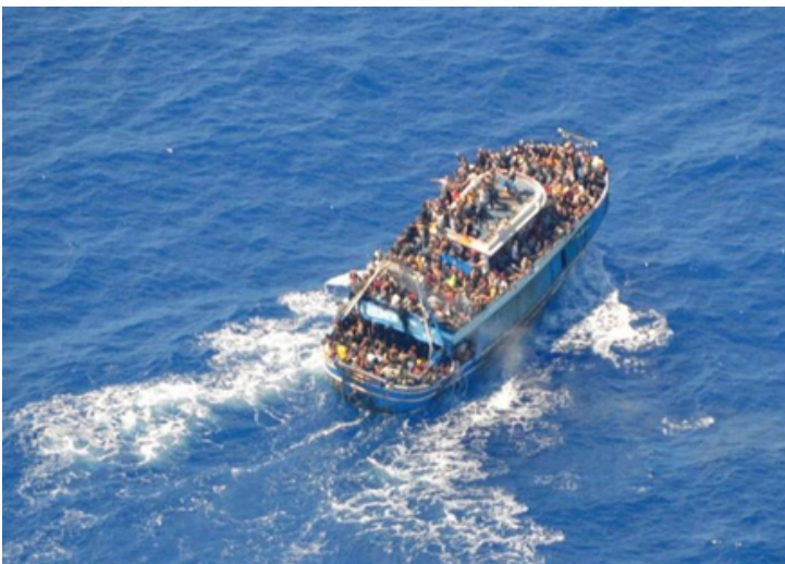
A photo provided by the Hellenic Coast Guard shows the overpacked decks of the fishing trawler before it capsized off the coast of Greece on June 14.

The survivors were taken to Kalamata and most of them were transferred to Malakasa Reception and Identification Centre (RIC) on 16th June. Relatives of people who were on the boat have been visiting the RIC for days to find out whether their own are among the survivors.