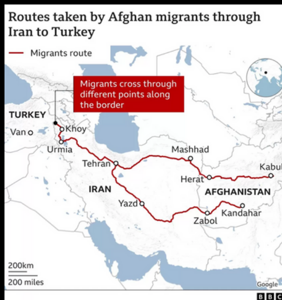
Map of the route taken by Afghan migrants from Iran to Turkey

The report closes stating that “Turkish authorities did not respond to the BBC's request for comment about these allegations.”