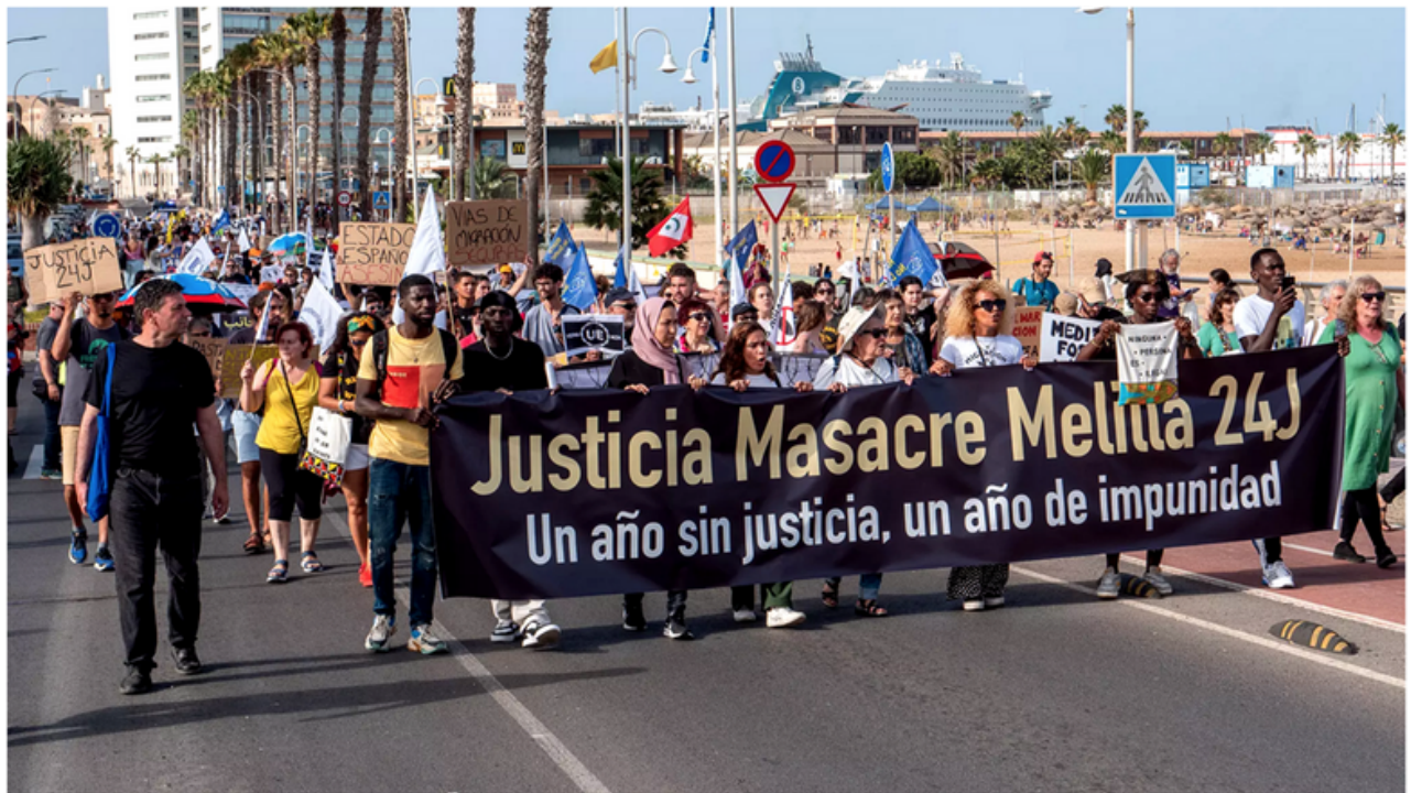
Caravana Abriendo Fronteras

Spain's insistence in pointing fingers at Moroccan authorities for their lack of transparency deeply contrasts with the country's and EU's readiness to increase funding, support and cooperation with Morocco regarding border controls in the past years and months. The EU has sent 346€ million to Morocco since 2019 and has pledged to send 500€ million more by 2027 , with plans to continue the externalization of EU borders through close cooperation with the North African state. Moreover, a year after the incident, accessing asylum procedures in Melilla, specially for people from Sub-Saharan Africa effectively remains an impossible mission, with zero asylum applications registered in the office of Beni Anzar (Melilla) in the past 12 months.