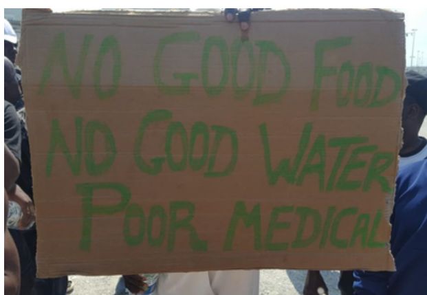
Picture of protest that took place in the Samos CCAC

On the same day, residents of the CCAC organized a protest to denounce their undignified living conditions. They held signs expressing their grievances and chanted "Samos Prison".