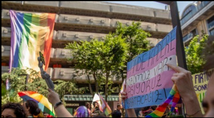
Istanbul Pride March