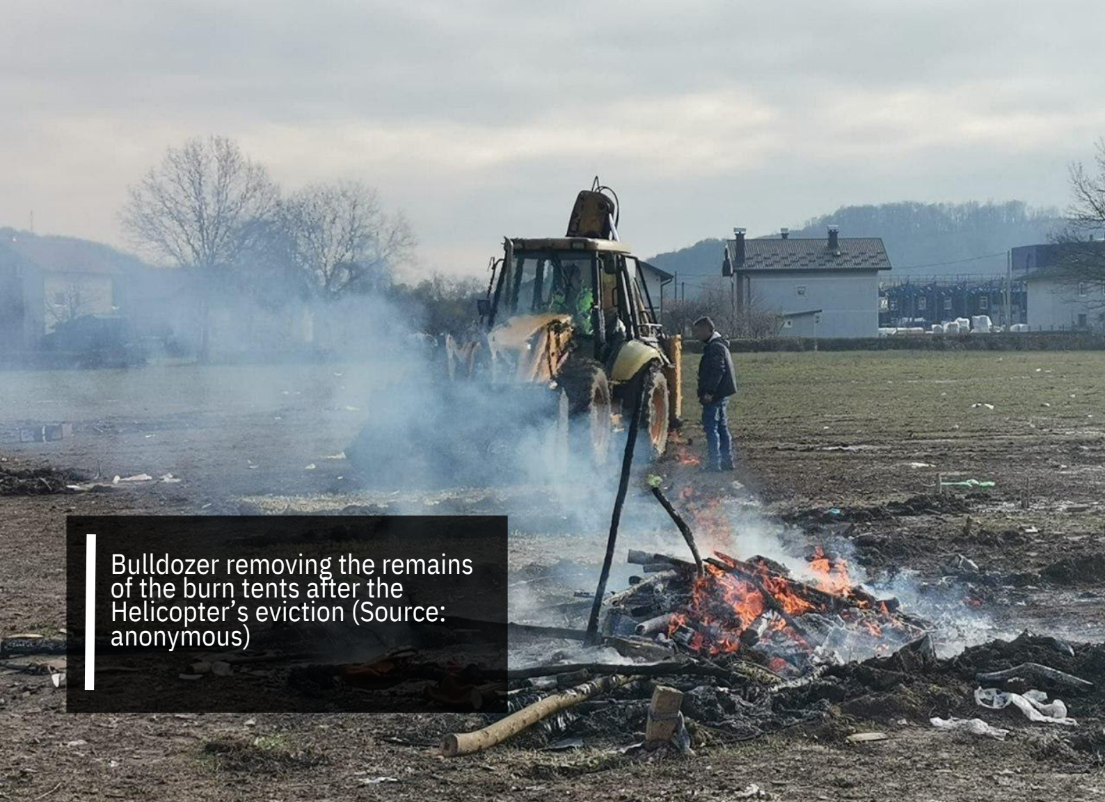
Bulldozer removing the remains of the burn tents after the Helicopter's eviction