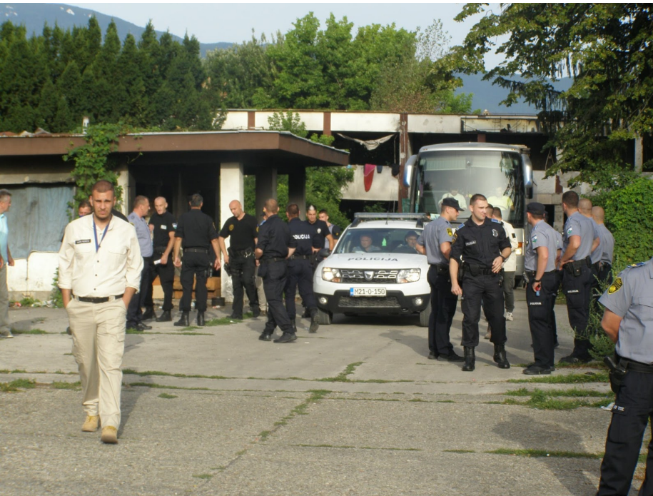
Police officers and SFA during the eviction in Krajna Metal in Bihać

The other main abandoned building used as a place of shelter in Bihać, Krajna Metal, was also evicted on the 13th of July, 2021. Previously an old factory, the building sheltered approximately 253 people and was evicted by the SFA in cooperation with IOM and the Bosnian Authorities and forcibly transported to the Lipa camp. Like the “Dom Penzionera” eviction, the removals took place early in the morning and accounts of police violence were reported. The move fits into an ongoing pattern of evictions and dispersals to Lipa which impacts people across urban and rural squats in the Bihać area, and across wider Una- Sana Canton (USC).