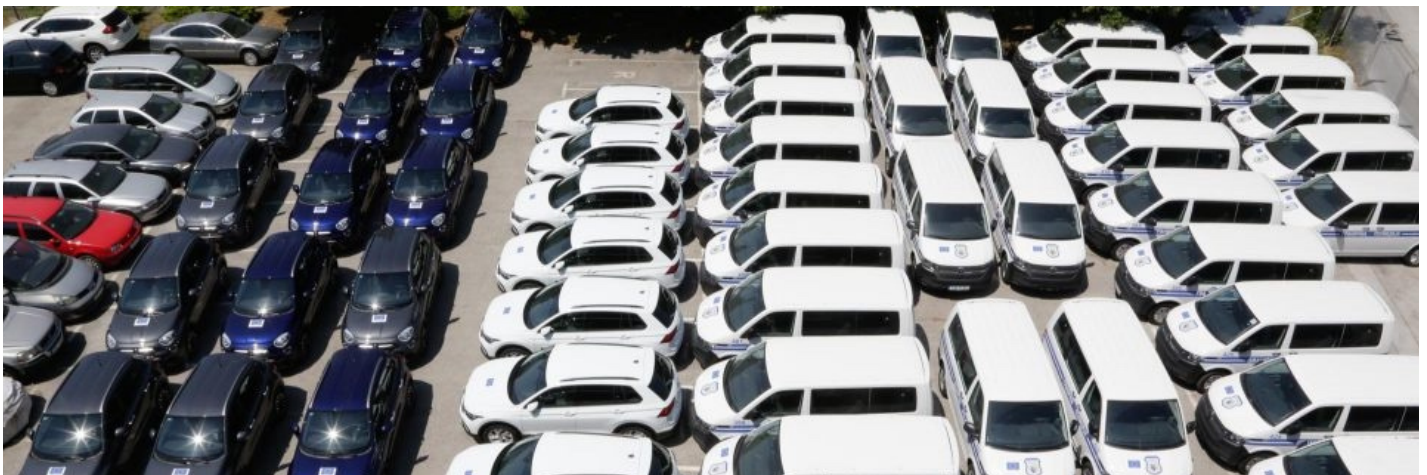
Vans donated by the EU to the Bosnian authorities