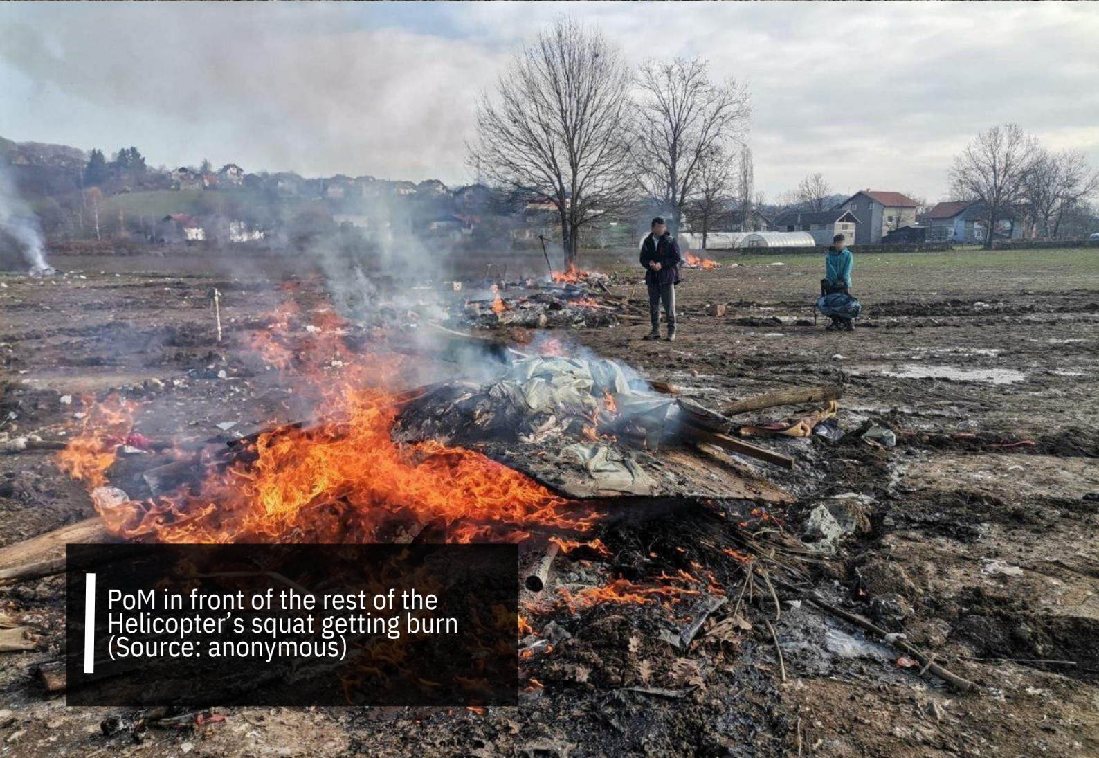
PoM in front of the rest of the Helicopter's squat getting burn