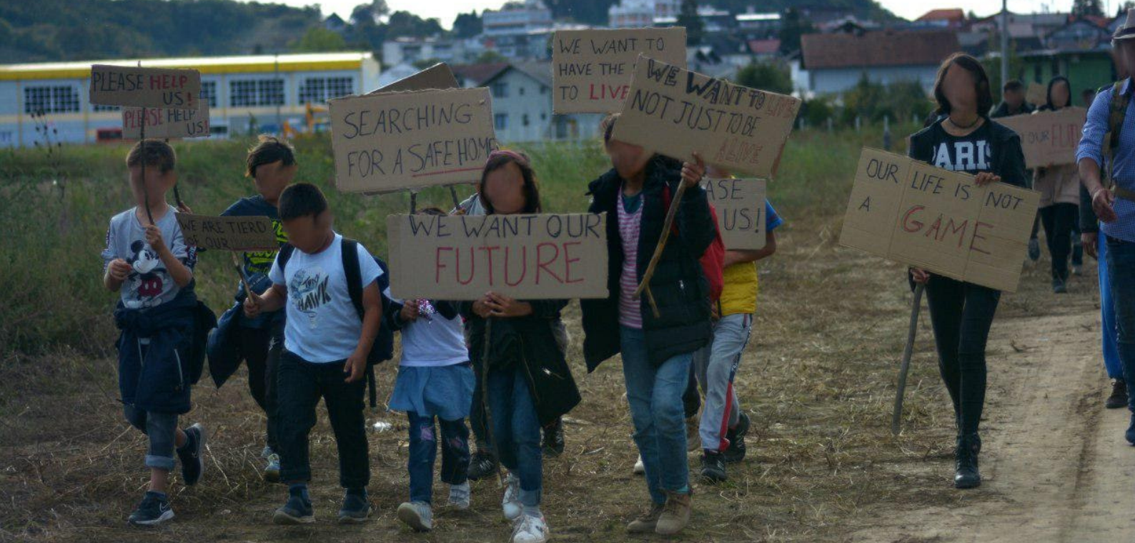
Protest for the freedom of movement organised by POMs