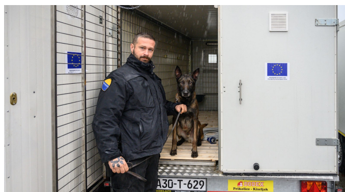
Bosnian police officer with a guard dog

Without the existence of a comprehensive and independent oversight mechanism, these donations further prioritize the criminalization over the assistance to people-on-the-move, and are likely to further enable human rights abuses by police officers.