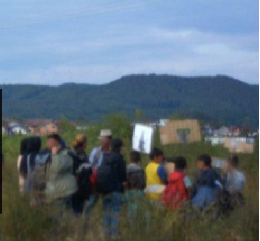
Protest for the freedom of movement organised by POMs

"We wanted to stay at the border until they make a decision for us. Because we are really tired of being here. And the weather is getting cold, so people don't know what to do. From every side, we are just pushed back."