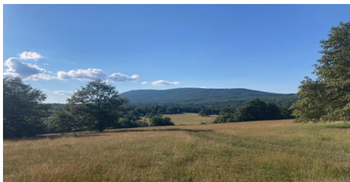
Image Description: Picture of the landscape in Lipa, BiH

This month, Bosnian police evicted three squats (empty buildings which are used as temporary housing) in Velika Kladuša, undermining the autonomy of people-on-the-move in the area. The people were taken into buses of the International Organisation of Migration (IOM) and were brought to the Lipa Camp at a distance of 80 km. The police destroyed the infrastructure in the squats and broke mobile phones. Some affected persons told us that they were insulted and beaten by the police. The police tried to evict more buildings but the inhabitants were able to escape to the nearby woods.