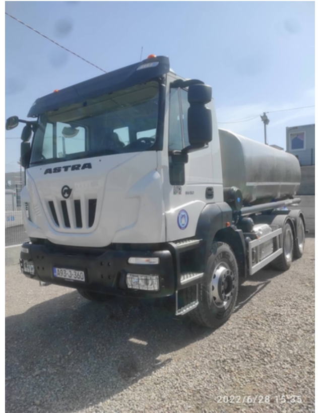
Image Description: cistern truck delivering water at Lipa camp