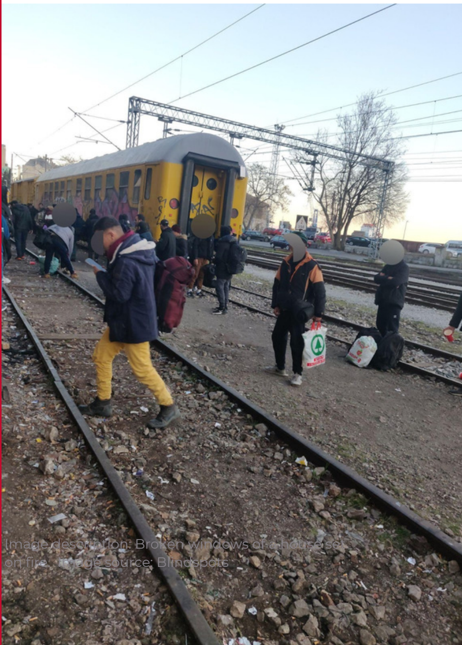
Image description: Broken windows of a house set on fire.

In Croatia, it is criminalised to provide direct support to people on the move. Nevertheless, locals have managed to set up a permanent emergency hub next to the train station in Rijeka in Autumn 2022. The initiative