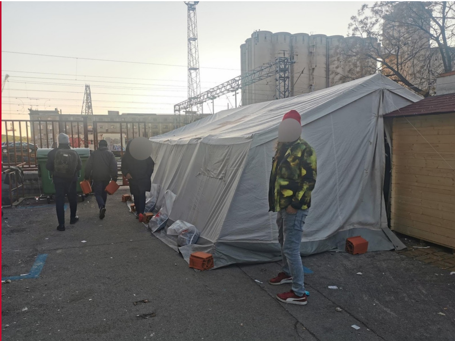
Emergency hub, train station in Rijeka.