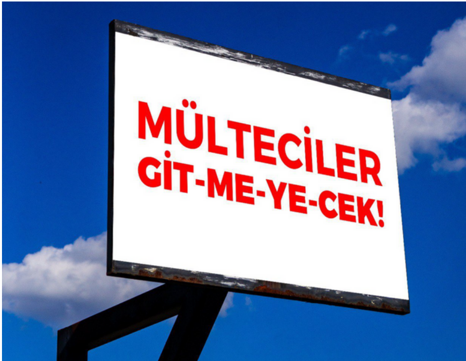
Trans Pride "billboard" image saying "Refugees Will Not Go!"