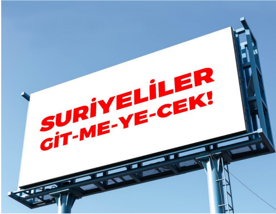
Trans Pride "billboard" image saying "Syrians Will Not Go" (Among Kemal Kılıçdarođlu's main campaign slogans was "Syrians Will Go!")