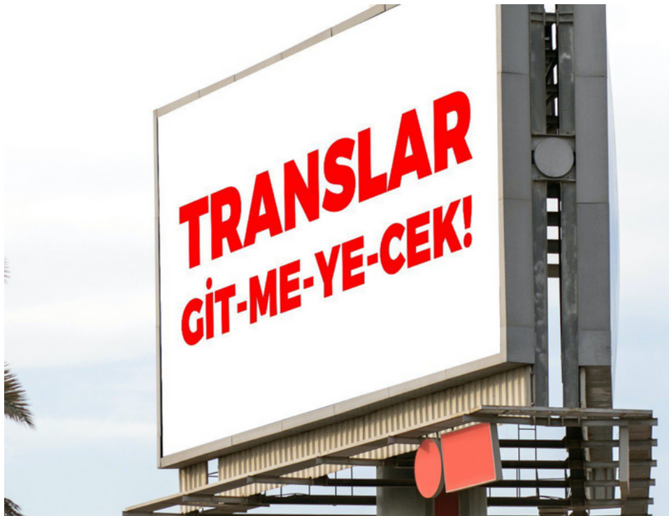
Trans Pride “billboard” image saying “Trans [people] Will Not Go!”