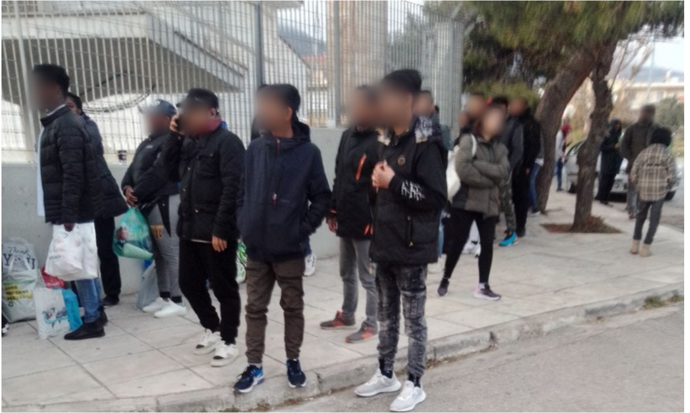
Image of a group of people in Acharnon, Athens, on their way to work before being apprehended by men in civil clothing driving a blue bus with “police” reportedly written on it. Image provided by a respondent whose testimony was taken by a member of BVMN.