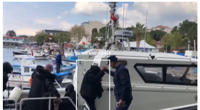
Stills from the NY Times report of May 19th showing the pushback survivors at various stages between Lesbos and their return to Turkish territory.