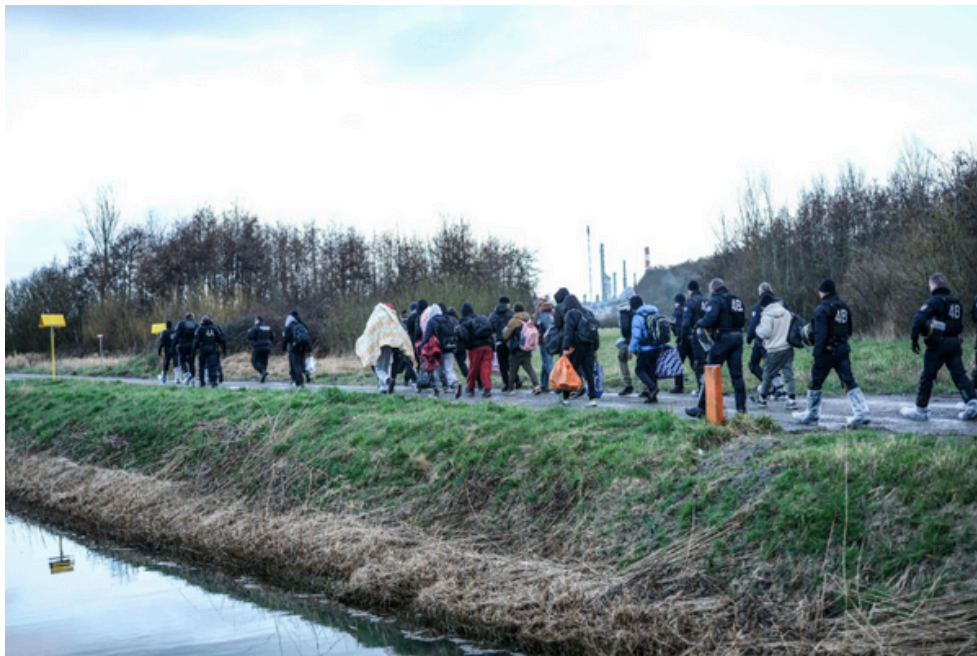
Eviction in Northern France.

All these instances of intimidation are repeated and systemic. It is clear these are mainly intended to hinder the work of organisations documenting and observing police operations, as other organisations present on or around the living sites during the evictions are usually ignored by the authorities.