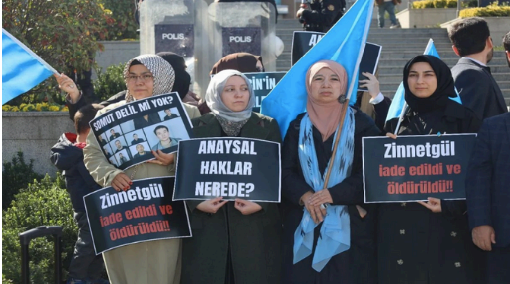
Protests against the deportation of Uyghur individuals.