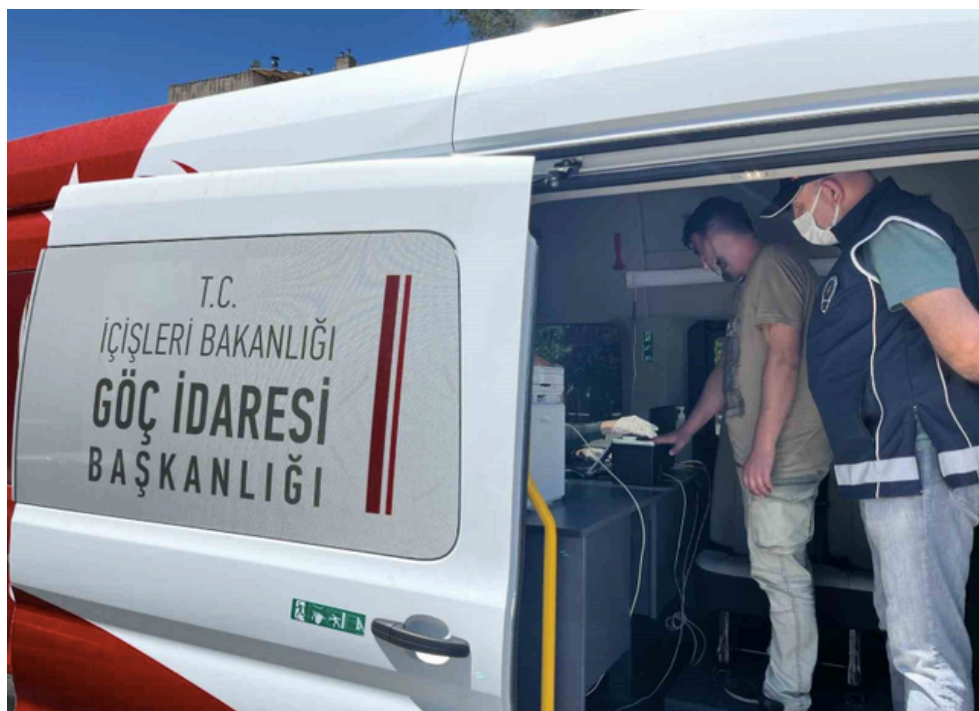
A Mobile Migration Point vehicle conducting an identification with biometric data.

The “Mobile Migration Point” vehicles are used to speed up the identification of foreign nationals unable to prove their identities during security checks. They are staffed by a migration expert and an interpreter from the Directorate of Migration Management, alongside police officers that stop and check passersby profiled as (potentially “irregular”) migrants. Migrants’ biometric data is cross-checked against the GöçNet database, and those who lack legal status are referred to removal centres. Following a meeting in March, it was announced that the vehicles will also soon be deployed to the Turkish Republic of Northern Cyprus.