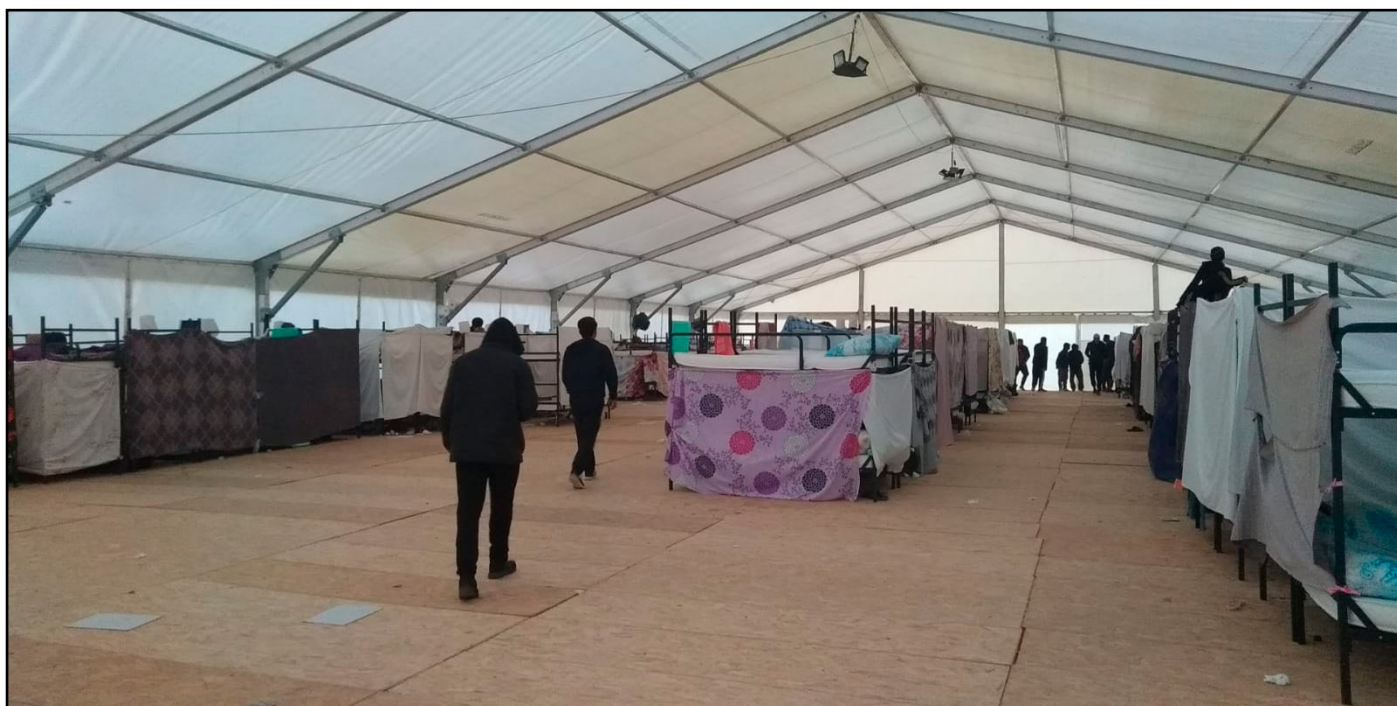
INSIDE THE NEWLY OPENED, EU-FUNDED LIPA CAMP IN BOSNOA-HERZEGOVINA

Similar guidelines were issued on asylum, return procedures and resettlement , but again fell shy of wider demands from initiatives such as the Leave No-one Behind campaign calling for the evacuation of people stuck in overcrowded camps in Greece. Dunja Mijatović, the Council of Europe Commissioner for Human Rights, also raised concerns over the growing risks for people being detained or at risk of removal. She urged states to “review the situation of rejected asylum seekers and irregular migrants in immigration detention, and to release them to the maximum extent possible”. While some divergent examples exist, such as the granting of temporary citizenship status for asylum seekers in Portugal, a more integrative approach to handling the crisis. Elsewhere in the EU such as in Croatia, and across the Greek-Balkan Routes, action was leant towards the surging up of borders rather than protecting those stuck at them.