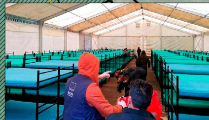
THOUSANDS OF INDIVIDUALS LIVING OUTSIDE OF THE CAMP SYSTEM IN TUZLA AND SARAJEVO MOVED TO BLAZUJ MARCH