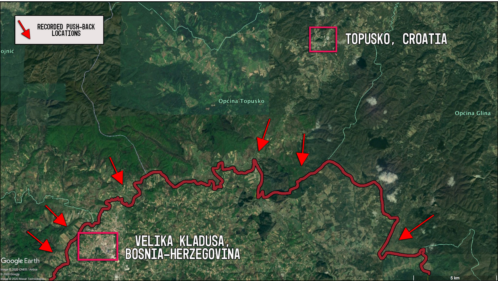
TOPUSKO (HR) MARKED BY RED SQUARE, OTHER POINTS MARK PUSHBACK LOCATIONS

It is already common knowledge that to staff Croatia's illegal pushback apparatus, hotels in the border area (such as the Lika-Sinj County ) are being provided as improvised barracks for hundreds of officers drafted from across the country. The new allegations about a similar site in Topusko, represent gross misconduct, putting the transit population in BiH's Una Sana Canton at huge risk of contracting COVID-19.