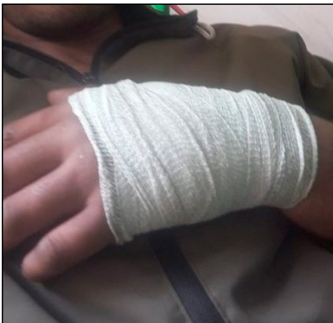
LEFT - INJURY TO HIS WRISTS SUSTAINED IN A BATON ATTACK BY GREEK AUTHORITIES