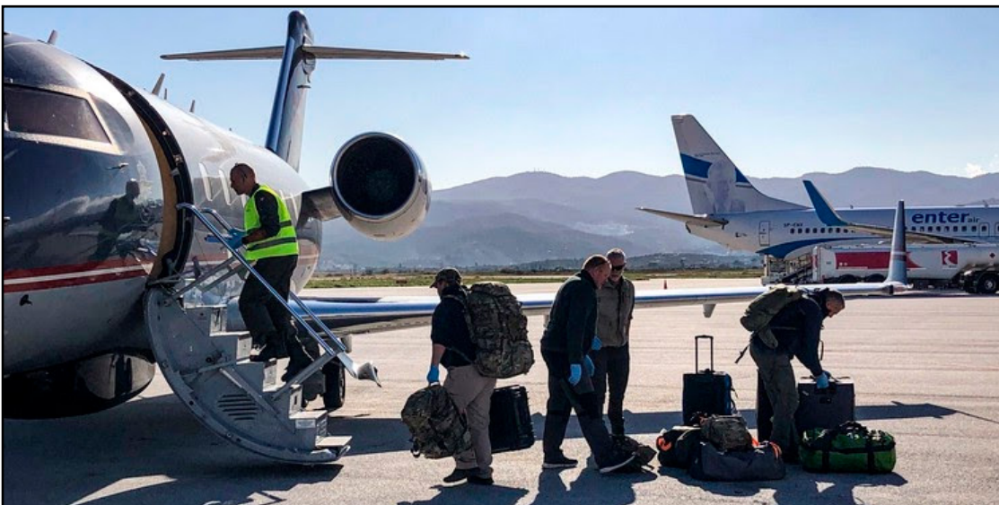
GERMAN AND DANISH OFFICERS ARRIVE IN APRIL TO GREECE

At a time when the Agency has been implicated in rights suspensions related to the Evros border, the permanence of its presence in Greece provides a disturbing account of EU action during the pandemic. In FRONTEX's statement , the assistance to Greece was described as support "despite the difficulties caused by the outbreak of COVID-19". However, in line with the ongoing militarisation and rights breaches being observed along the Balkan Route, the continued deployment might be better understood as intimately related to the pandemic. Within the call by the EU and international institutions for tighter borders, the permanent installation of bodies like FRONTEX have been achieved through the conduit of COVID-19.