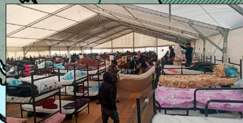
LIPA CAMP IS OPENED WITH FUNDING FROM THE EU ON APRIL 21ST

FIGHT BREAKS OUT IN THE MINORS WING OF BIHAC RTC IN LATE APRIL