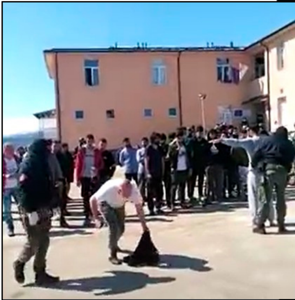
TWO AUTHORITIES CARRYING OUT PAT DOWN SEARCHES OF THE CAMP RESIDENTS IN TUTIN, SERBIA.

PUSHBACK: SERBIA – GREECE DATE: 3RD APRIL 2020