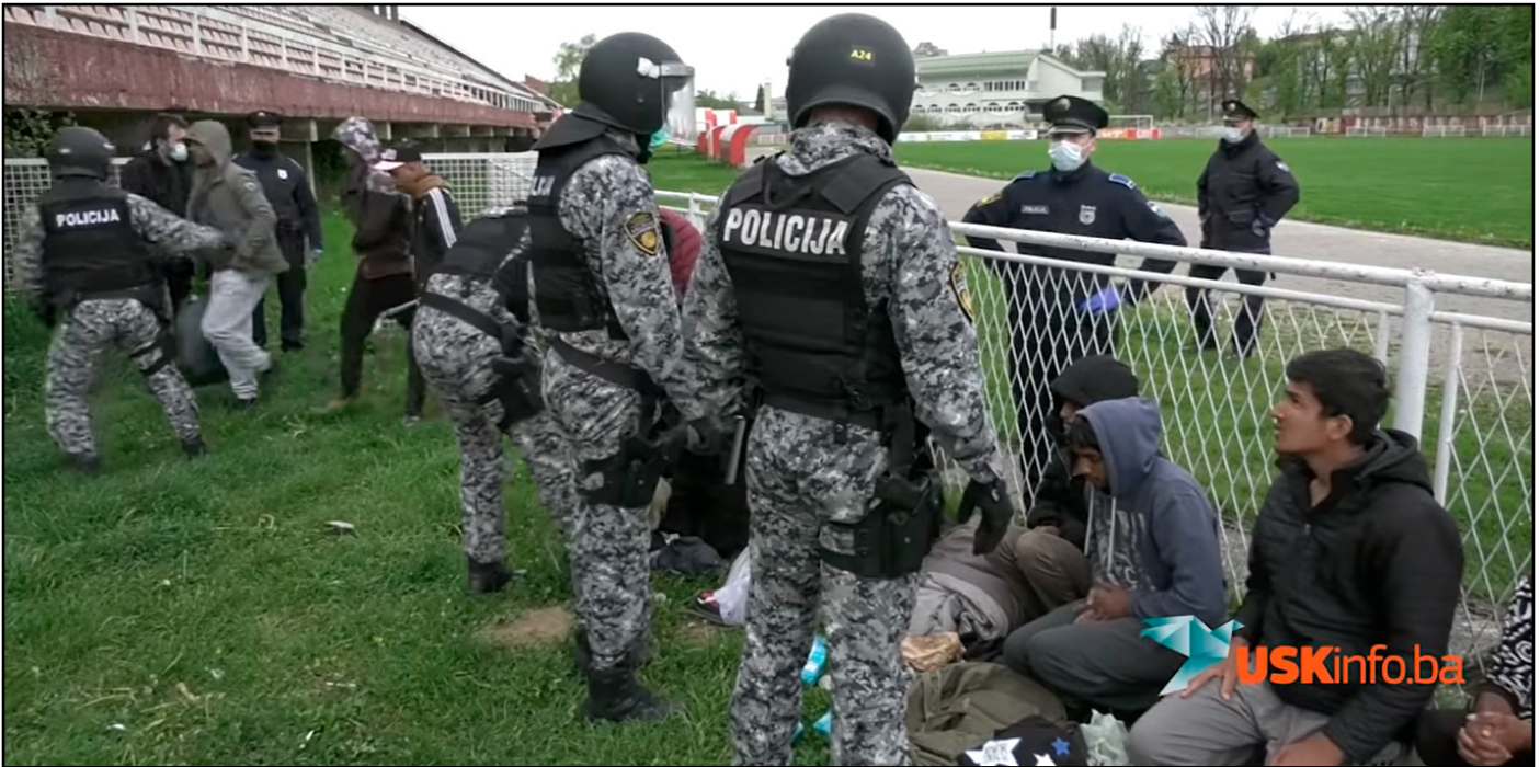
POLICE REMOVING PEOPLE SLEEPING IN A FOOTBALL STADIUM IN BIHAC.