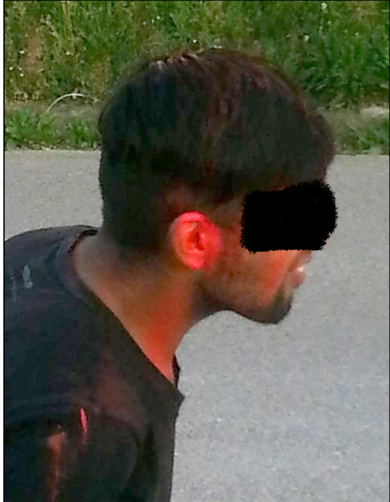
ORANGE SPRAY PAINT MARKINGS ON TRANSIT GROUPS PUSHED BACK FROM HR TO BIH

Hearing reports of increased brutality during push-backs is worrying due to the increased autonomy that state authorities have taken for themselves during these course of the pandemic. Push-backs are illegal and the spread of COVID-19 is not an excuse to confront vulnerable people with even more violence.