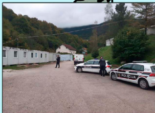
FATHER OF FOUR LIVING IN USIVAK CAMP WITH HIS FAMILY DIED IN APRIL, ALLEGEDLY FROM INJURIES SUSTAINED FROM A CAMP SECURITY GUARD