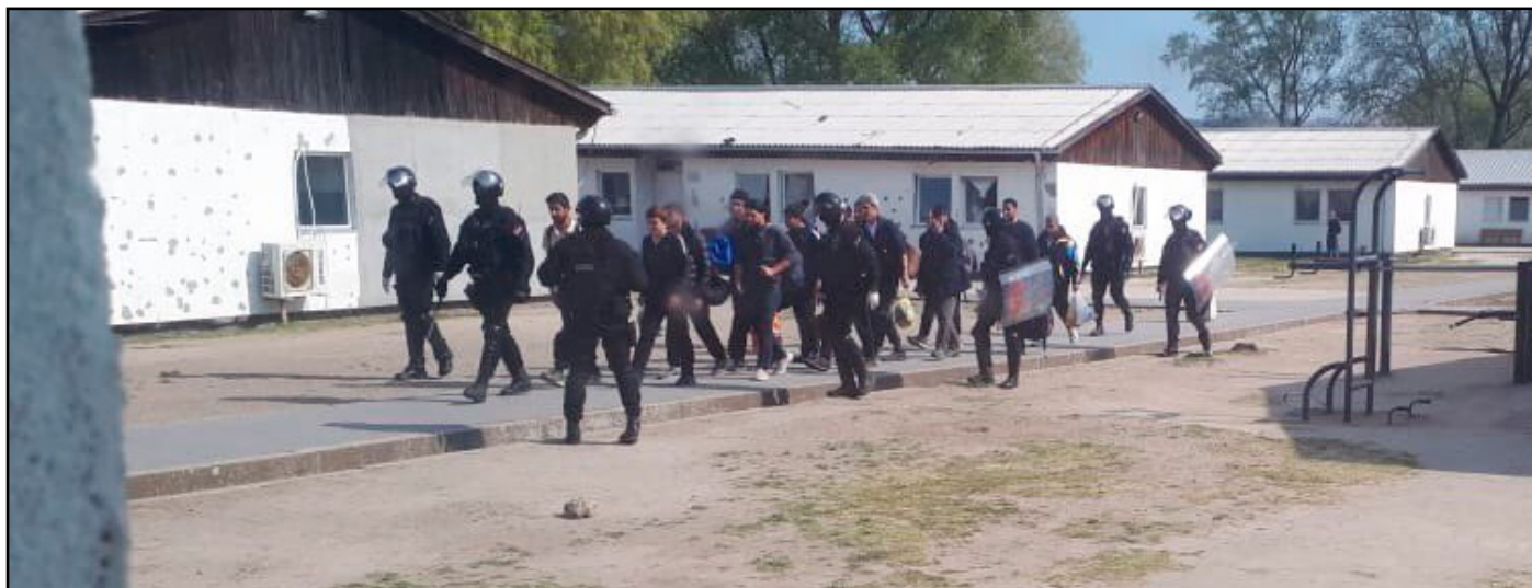
ESCORT OF SERBIAN AUTHORITIES IN RIOT GEAR IN KRNJACA CAMP.

Since Serbian President Vucic issued a state of emergency in Serbia on 15th March 2020, refugees and migrants have not been allowed out of the transit and asylum centers unless it is to seek medical care, or with special permission. The ban applies for those entering camps as well, so the majority of staff from human rights organizations and NGOs cannot enter the facilities either. In the event that a certain person succeeds in leaving the camp without a permit , there is the risk of misdemeanour or criminal liability. Sweeps for refugees and migrants living in squats and informal accommodations reportedly intensified after this declaration, with apprehended individuals then being brought to different camps around the country. The declaration of a state of emergency also led to heightened military presence in camps around the country.